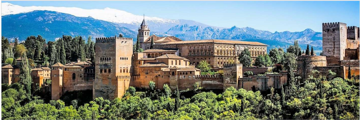
Alhambra Palace, Granada

Highlights • Madrid • Toledo • Avila • Segovia • Alcazar • Cordoba • Mezquita-Cathedral • Historic Seville • Santa Cruz Quarter • Malaga