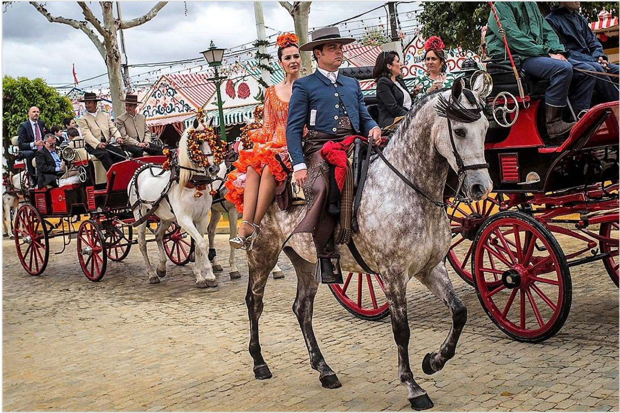
Andalusian Horse, Seville Fair

Highlights • Madrid • Toledo • Avila • Segovia • Alcazar • Cordoba • Mezquita-Cathedral • Historic Seville • Santa Cruz Quarter • Malaga