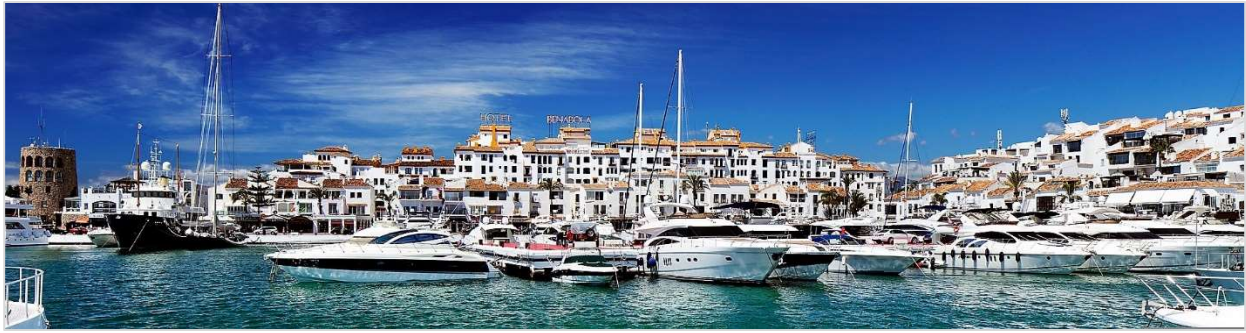
Marbella Yacht Club, Costa del Sol

Highlights • Madrid • Toledo • Avila • Segovia • Alcazar • Cordoba • Mezquita-Cathedral • Historic Seville • Santa Cruz Quarter • Malaga