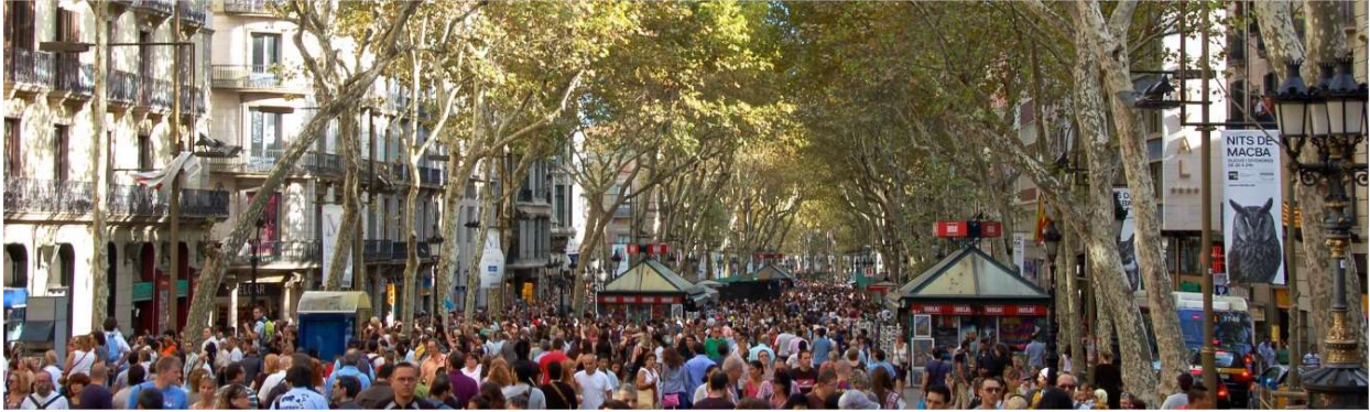
Las Ramblas, Barcelona

Highlights • Barcelona Hop-on and Hop-off Tour Bus • Gaudi and Sagrada Familia Skip the Line • Private transfers from/to Barcelona airport or from/to Barcelona Cruise Port By Deluxe Mercedes Benz E-Class Sedan • Assistance in Barcelona