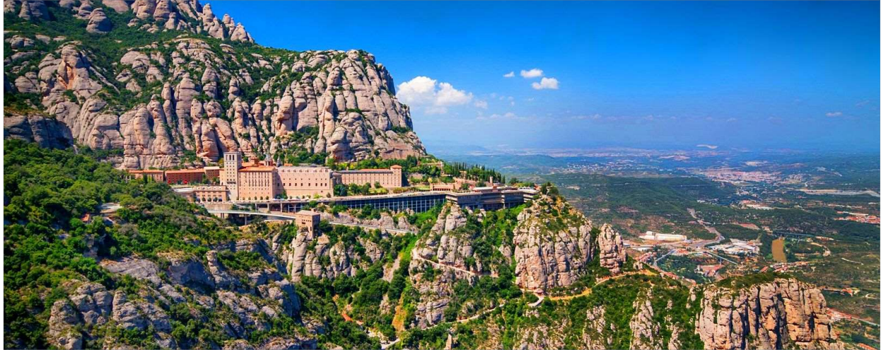
Montserrat Abbey, Barcelona

Highlights • Barcelona Hop-on and Hop-off Tour Bus • Gaudi and Sagrada Familia Skip the Line • Private transfers from/to Barcelona airport or from/to Barcelona Cruise Port By Deluxe Mercedes Benz E-Class Sedan • Assistance in Barcelona