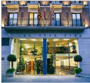
Onix Rambla Hotel

Highlights • Barcelona Hop-on and Hop-off Tour Bus • Gaudi and Sagrada Familia Skip the Line • Private transfers from/to Barcelona airport or from/to Barcelona Cruise Port By Deluxe Mercedes Benz E-Class Sedan • Assistance in Barcelona