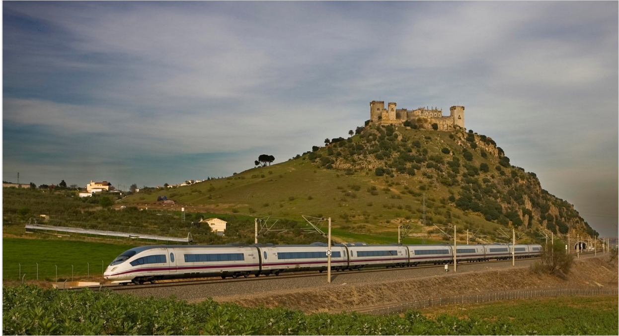
AVE Speed Train Madrid-Seville

Highlights • Lisbon • Tagus River • Belem Quarters • Sintra • Estoril Coast • Madrid • Toledo • Segovia • AVE Speed Train • Seville • Jewish Quarter • Cordoba Cathedral • Granada • Alhambra Palace • Barcelona • Gaudi Sagrada Familia • Montserrat Convent • Costa Brava Beaches.