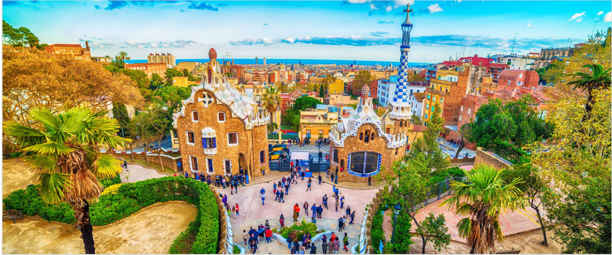
Park Güell, Barcelona Spain

Highlights • Lisbon • Tagus River • Belem Quarters • Sintra • Estoril Coast • Madrid • Toledo • Segovia • AVE Speed Train • Seville • Jewish Quarter • Cordoba Cathedral • Granada • Alhambra Palace • Barcelona • Gaudi Sagrada Familia • Montserrat Convent • Costa Brava Beaches.