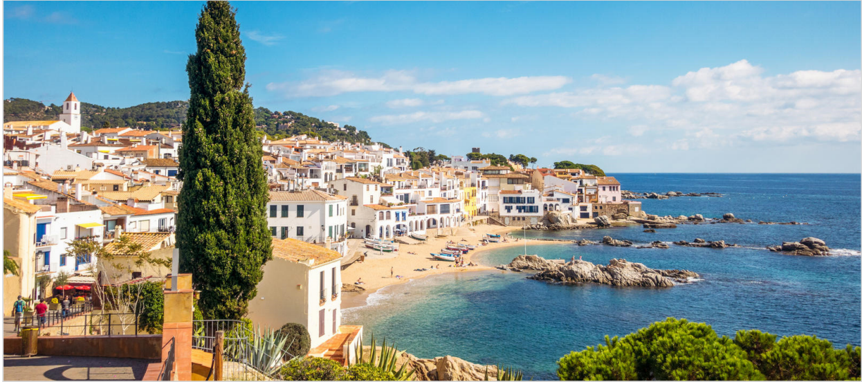
Costa Brava, Spain

Highlights • Lisbon • Tagus River • Belem Quarters • Sintra • Estoril Coast • Madrid • Toledo • Segovia • AVE Speed Train • Seville • Jewish Quarter • Cordoba Cathedral • Granada • Alhambra Palace • Barcelona • Gaudi Sagrada Familia • Montserrat Convent • Costa Brava Beaches.