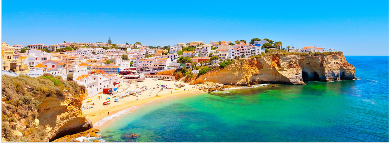
Estoril Coast, Portugal

Highlights • Lisbon • Tagus River • Belem Quarters • Sintra • Estoril Coast • Madrid • Toledo • Segovia • AVE Speed Train • Seville • Jewish Quarter • Cordoba Cathedral • Granada • Alhambra Palace • Barcelona • Gaudi Sagrada Familia • Montserrat Convent • Costa Brava Beaches.