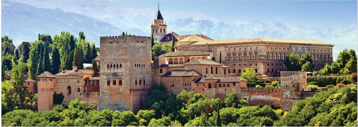
Alhambra Palace, Granada Spain

Highlights • Lisbon • Tagus River • Belem Quarters • Sintra • Estoril Coast • Madrid • Toledo • Segovia • AVE Speed Train • Seville • Jewish Quarter • Cordoba Cathedral • Granada • Alhambra Palace • Barcelona • Gaudi Sagrada Familia • Montserrat Convent • Costa Brava Beaches.