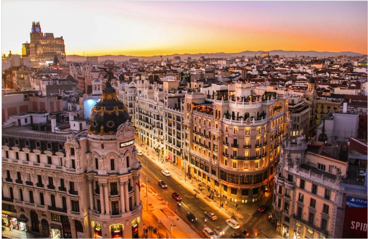
Gran Via Madrid, Spain

Highlights • Lisbon • Tagus River • Belem Quarters • Sintra • Estoril Coast • Madrid • Toledo • Segovia • AVE Speed Train • Seville • Jewish Quarter • Cordoba Cathedral • Granada • Alhambra Palace • Barcelona • Gaudi Sagrada Familia • Montserrat Convent • Costa Brava Beaches.