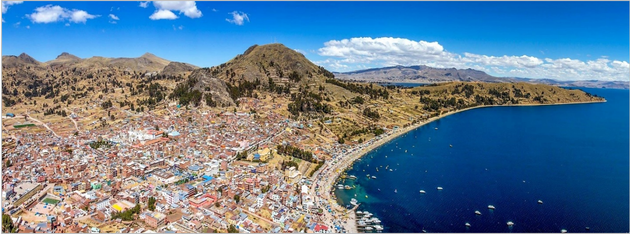
Copacabana, Lake Titicaca Bolivia

Highlights • Lima, Peru • Awana Kancha • Pisac Town • Sacred Valley • Aguas Calientes • Machu Picchu • Inca Trail • Ollantaytambo • Moray • Salineras de Maras • Saqsawaman Forterss • Puka Pukara • Qenko • Imperial Cusco • Qorikancha • San Blas Neighborhood • La Paz, Bolivia • Moon Valley • Copacabana • Isla del Sol • Uyuni Salt Flats • Colchani • Incahuasi • Andean 4x4 Safari • Valley of the Rocks • Red Lagoon • Green Lagoon • White Lagoon • San Pedro de Atacama, Chile • Death Valley Sunset Tour • Calama • Santiago • Viña del Mar • Valparaiso • Indomita Vineyard • Buenos Aires • Tango Show • Foz do Iguacu, Brazil • Itaipu Dam • Bird Sanctuary • Rio de Janeiro • Sugar Loaf • Corcovado.