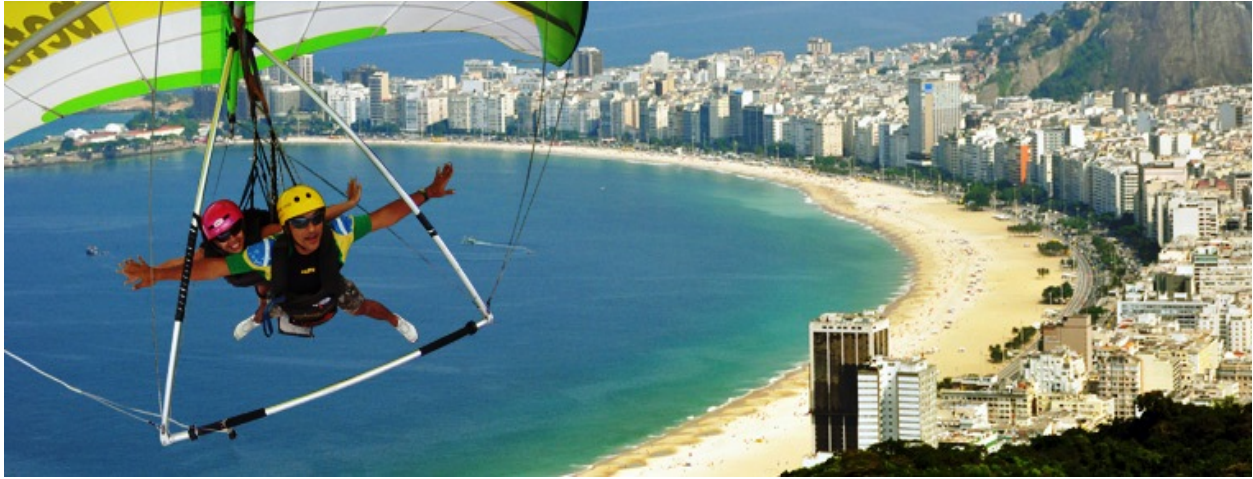
Copacabana Rio de Janeiro

Highlights • Lima, Peru • Awana Kancha • Pisac Town • Sacred Valley • Aguas Calientes • Machu Picchu • Inca Trail • Ollantaytambo • Moray • Salineras de Maras • Saqsawaman Forterss • Puka Pukara • Qenko • Imperial Cusco • Qorikancha • San Blas Neighborhood • La Paz, Bolivia • Moon Valley • Copacabana • Isla del Sol • Uyuni Salt Flats • Colchani • Inkahuasi • Andean 4x4 Safari • Valley of the Rocks • Red Lagoon • Green Lagoon • White Lagoon • San Pedro de Atacama, Chile • Death Valley Sunset Tour • Calama • Santiago • Viña del Mar • Valparaiso • Indomita Vineyard • Buenos Aires • Tango Show • Foz do Iguacu, Brazil • Itaipu Dam • Bird Sanctuary • Rio de Janeiro • Sugar Loaf • Corcovado.