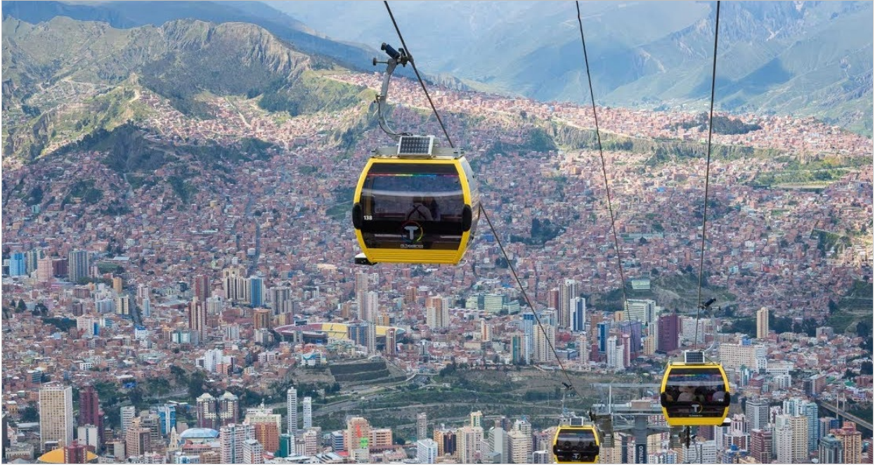
La Paz, Bolivia

Highlights • Lima, Peru • Awana Kancha • Pisac Town • Sacred Valley • Aguas Calientes • Machu Picchu • Inca Trail • Ollantaytambo • Moray • Salineras de Maras • Saqsawaman Forterss • Puka Pukara • Qenko • Imperial Cusco • Qorikancha • San Blas Neighborhood • La Paz, Bolivia • Moon Valley • Copacabana • Isla del Sol • Uyuni Salt Flats • Colchani • Inkahuasi • Andean 4x4 Safari • Valley of the Rocks • Red Lagoon • Green Lagoon • White Lagoon • San Pedro de Atacama, Chile • Death Valley Sunset Tour • Calama • Santiago • Viña del Mar • Valparaiso • Indomita Vineyard • Buenos Aires • Tango Show • Foz do Iguacu, Brazil • Itaipu Dam • Bird Sanctuary • Rio de Janeiro • Sugar Loaf • Corcovado.