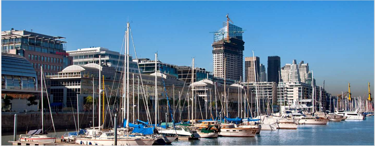
Puerto Madero, Buenos Aires

Highlights • Lima, Peru • Awana Kanca • Pisac Town • Sacred Valley • Aguas Calientes • Machu Picchu • Inca Trail • Ollantaytambo • Moray • Salineras de Maras • Saqsawaman Forterss • Puka Pukara • Qenko • Imperial Cusco • Qorikancha • San Blas Neighborhood • La Paz, Bolivia • Moon Valley • Copacabana • Isla del Sol • Uyuni Salt Flats • Colchani • Inkahuasi • Andean 4x4 Safari • Valley of the Rocks • Red Lagoon • Green Lagoon • White Lagoon • San Pedro de Atacama, Chile • Death Valley Sunset Tour • Calama • Santiago • Viña del Mar • Valparaiso • Indomita Vineyard • Buenos Aires • Tango Show • Foz do Iguacu, Brazil • Itaipu Dam • Bird Sanctuary • Rio de Janeiro • Sugar Loaf • Corcovado.