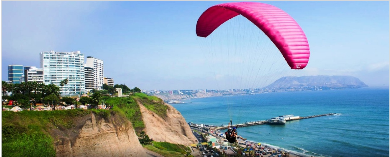
Larcomar Miraflores Lima

Highlights • Lima, Peru • Awana Kancha • Pisac Town • Sacred Valley • Aguas Calientes • Machu Picchu • Inca Trail • Ollantaytambo • Moray • Salineras de Maras • Saqsawaman Forterss • Puka Pukara • Qenko • Imperial Cusco • Qorikancha • San Blas Neighborhood • La Paz, Bolivia • Moon Valley • Copacabana • Isla del Sol • Uyuni Salt Flats • Colchani • Inkahuasi • Andean 4x4 Safari • Valley of the Rocks • Red Lagoon • Green Lagoon • White Lagoon • San Pedro de Atacama, Chile • Death Valley Sunset Tour • Calama • Santiago • Viña del Mar • Valparaiso • Indomita Vineyard • Buenos Aires • Tango Show • Foz do Iguaçu, Brazil • Itaipu Dam • Bird Sanctuary • Rio de Janeiro • Sugar Loaf • Corcovado.