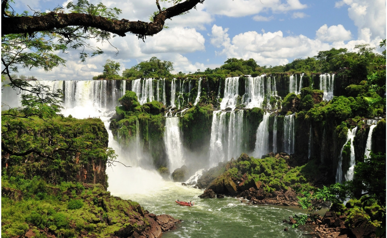
Foz do Iguacu

Highlights • Lima, Peru • Awana Kancha • Pisac Town • Sacred Valley • Aguas Calientes • Machu Picchu • Inca Trail • Ollantaytambo • Moray • Salineras de Maras • Saqsawaman Forterss • Puka Pukara • Qenko • Imperial Cusco • Qorikancha • San Blas Neighborhood • La Paz, Bolivia • Moon Valley • Copacabana • Isla del Sol • Uyuni Salt Flats • Colchani • Inkahuasi • Andean 4x4 Safari • Valley of the Rocks • Red Lagoon • Green Lagoon • White Lagoon • San Pedro de Atacama, Chile • Death Valley Sunset Tour • Calama • Santiago • Viña del Mar • Valparaiso • Indomita Vineyard • Buenos Aires • Tango Show • Foz do Iguacu, Brazil • Itaipu Dam • Bird Sanctuary • Rio de Janeiro • Sugar Loaf • Corcovado.