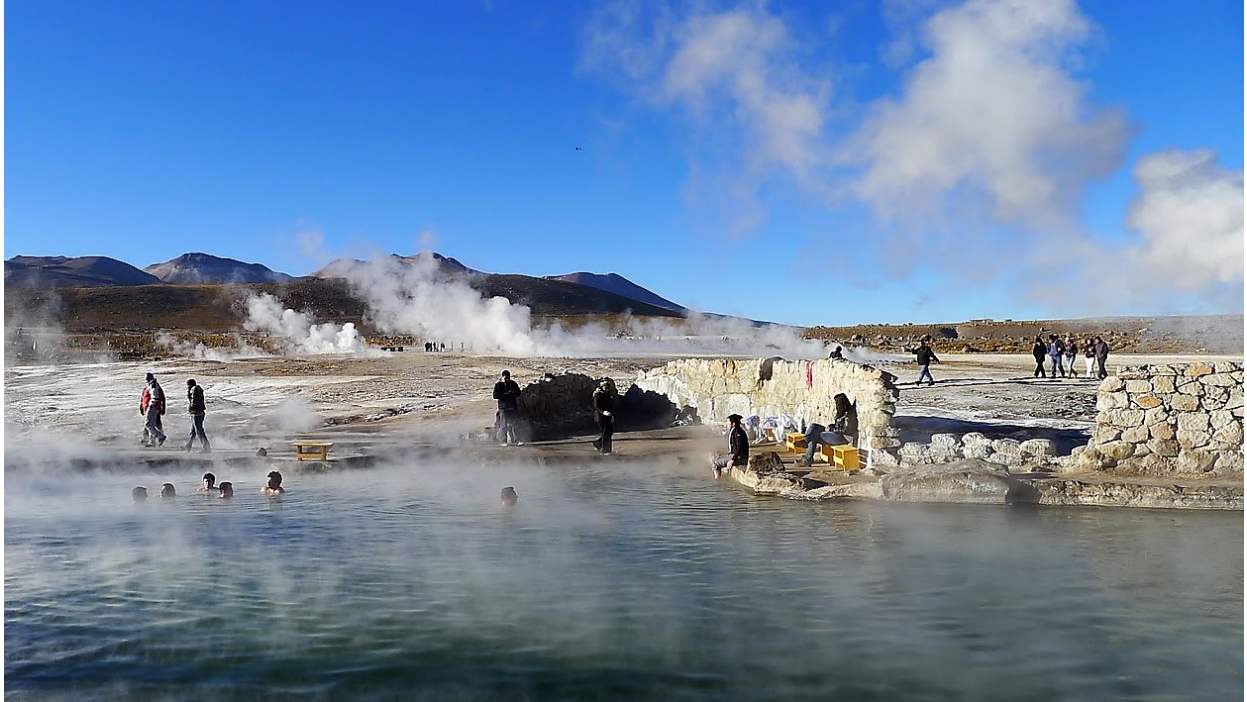
Tatio Geysers, Chile

Highlights • Lima, Peru • Awana Kancha • Pisac Town • Sacred Valley • Aguas Calientes • Machu Picchu • Inca Trail • Ollantaytambo • Moray • Salineras de Maras • Saqsawaman Forterss • Puka Pukara • Qenko • Imperial Cusco • Qorikancha • San Blas Neighborhood • La Paz, Bolivia • Moon Valley • Copacabana • Isla del Sol • Uyuni Salt Flats • Colchani • Inkahuasi • Andean 4x4 Safari • Valley of the Rocks • Red Lagoon • Green Lagoon • White Lagoon • San Pedro de Atacama, Chile • Death Valley Sunset Tour • Calama • Santiago • Viña del Mar • Valparaiso • Indomita Vineyard • Buenos Aires • Tango Show • Foz do Iguacu, Brazil • Itaipu Dam • Bird Sanctuary • Rio de Janeiro • Sugar Loaf • Corcovado.