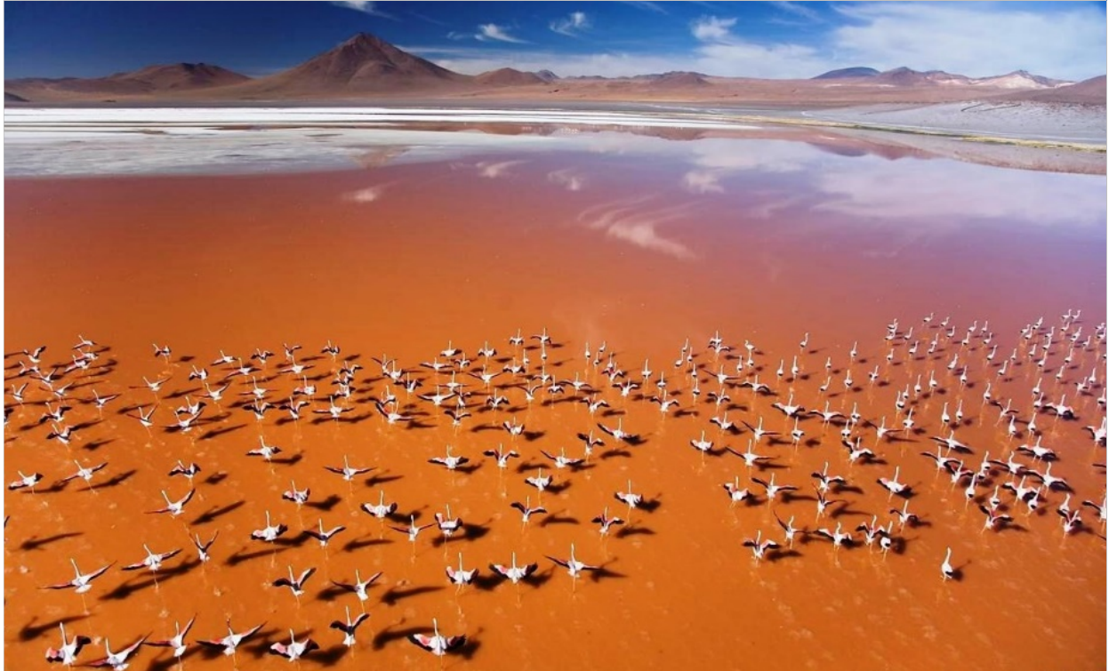
Red Lagoon (Laguna Colorada), Bolivia

Highlights • Lima, Peru • Awana Kancha • Pisac Town • Sacred Valley • Aguas Calientes • Machu Picchu • Inca Trail • Ollantaytambo • Moray • Salineras de Maras • Saqsawaman Forterss • Puka Pukara • Qenko • Imperial Cusco • Qorikancha • San Blas Neighborhood • La Paz, Bolivia • Moon Valley • Copacabana • Isla del Sol • Uyuni Salt Flats • Colchani • Inkahuasi • Andean 4x4 Safari • Valley of the Rocks • Red Lagoon • Green Lagoon • White Lagoon • San Pedro de Atacama, Chile • Death Valley Sunset Tour • Calama • Santiago • Viña del Mar • Valparaiso • Indomita Vineyard • Buenos Aires • Tango Show • Foz do Iguacu, Brazil • Itaipu Dam • Bird Sanctuary • Rio de Janeiro • Sugar Loaf • Corcovado.