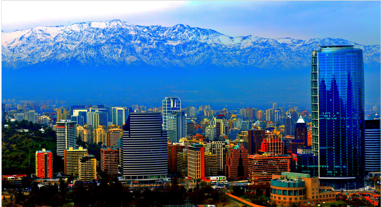
Sunset in Santiago de Chile

Highlights • Lima, Peru • Awana Kancha • Pisac Town • Sacred Valley • Aguas Calientes • Machu Picchu • Inca Trail • Ollantaytambo • Moray • Salineras de Maras • Saqsawaman Forterss • Puka Pukara • Qenko • Imperial Cusco • Qorikancha • San Blas Neighborhood • La Paz, Bolivia • Moon Valley • Copacabana • Isla del Sol • Uyuni Salt Flats • Colchani • Inkahuasi • Andean 4x4 Safari • Valley of the Rocks • Red Lagoon • Green Lagoon • White Lagoon • San Pedro de Atacama, Chile • Death Valley Sunset Tour • Calama • Santiago • Viña del Mar • Valparaiso • Indomita Vineyard • Buenos Aires • Tango Show • Foz do Iguacu, Brazil • Itaipu Dam • Bird Sanctuary • Rio de Janeiro • Sugar Loaf • Corcovado.