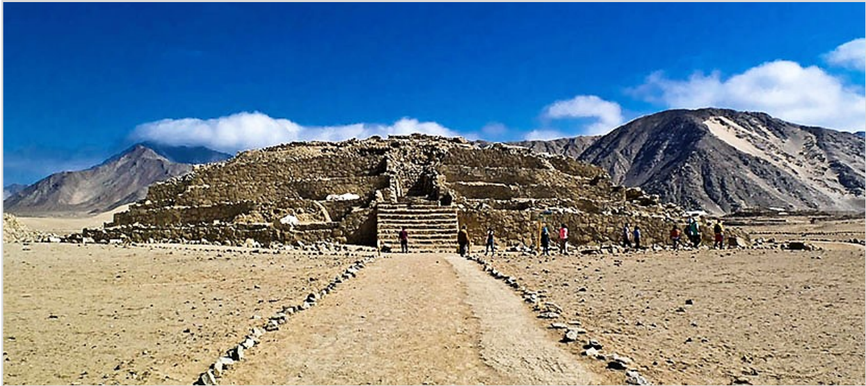
Caral a UNESCO World Heritage Site

Highlights • Caral UNESCO World Heritage Site • Barranca • Chavin de Guantar • Huaraz • Llanganuco Lakes • Cordillera Blanca • Yungay • Trujillo • Urquiaga-Calonge House • Temples of Moche • Huanchaco • Chan Chan • Talara • Peruvian Northern Beaches • 12 Meals.