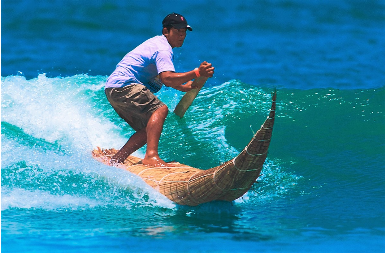
Surfing in Northern Peru

Highlights • Caral UNESCO World Heritage Site • Barranca • Chavin de Guantar • Huaraz • Llanganuco Lakes • Cordillera Blanca • Yungay • Trujillo • Urquiaga-Calonge House • Temples of Moche • Huanchaco • Chan Chan • Talara • Peruvian Northern Beaches • 12 Meals.