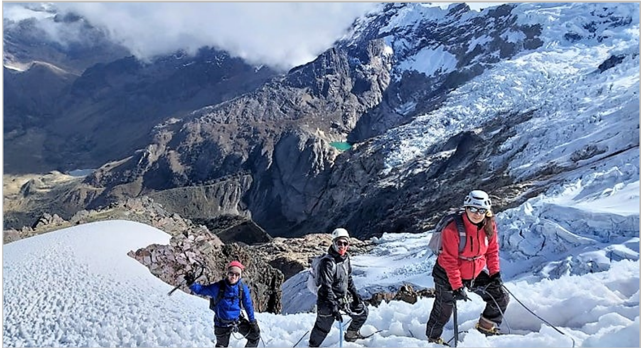
Nevado Mateo Trek 5,150 meters

Highlights • Caral UNESCO World Heritage Site • Barranca • Chavin de Guantar • Huaraz • Llanganuco Lakes • Cordillera Blanca • Yungay • Trujillo • Urquiaga-Calonge House • Temples of Moche • Huanchaco • Chan Chan • Talara • Peruvian Northern Beaches • 12 Meals.