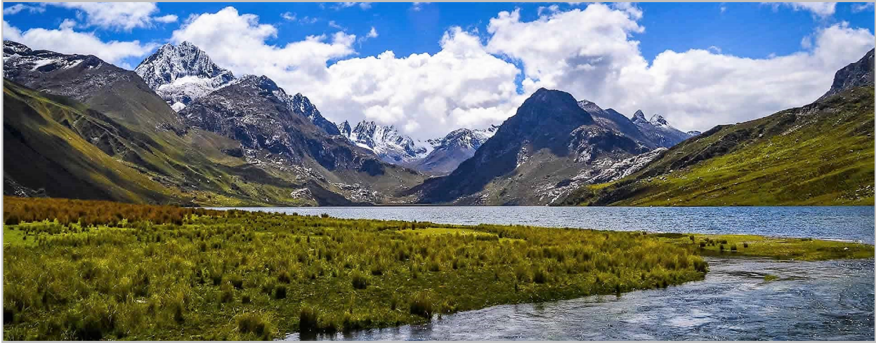
Callejón de Huaylas, Huaraz

Highlights • Caral UNESCO World Heritage Site • Barranca • Chavin de Guantar • Huaraz • Llanganuco Lakes • Cordillera Blanca • Yungay • Trujillo • Urquiaga-Calonge House • Temples of Moche • Huanchaco • Chan Chan • Talara • Peruvian Northern Beaches • 12 Meals.