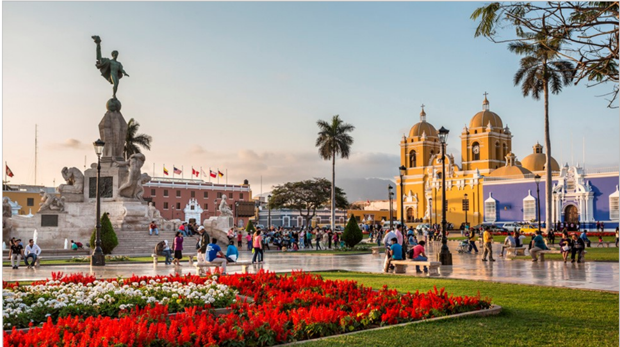
Trujillo Main Square

Highlights • Caral UNESCO World Heritage Site • Barranca • Chavin de Guantar • Huaraz • Llanganuco Lakes • Cordillera Blanca • Yungay • Trujillo • Urquiaga-Calonge House • Temples of Moche • Huanchaco • Chan Chan • Talara • Peruvian Northern Beaches • 12 Meals.