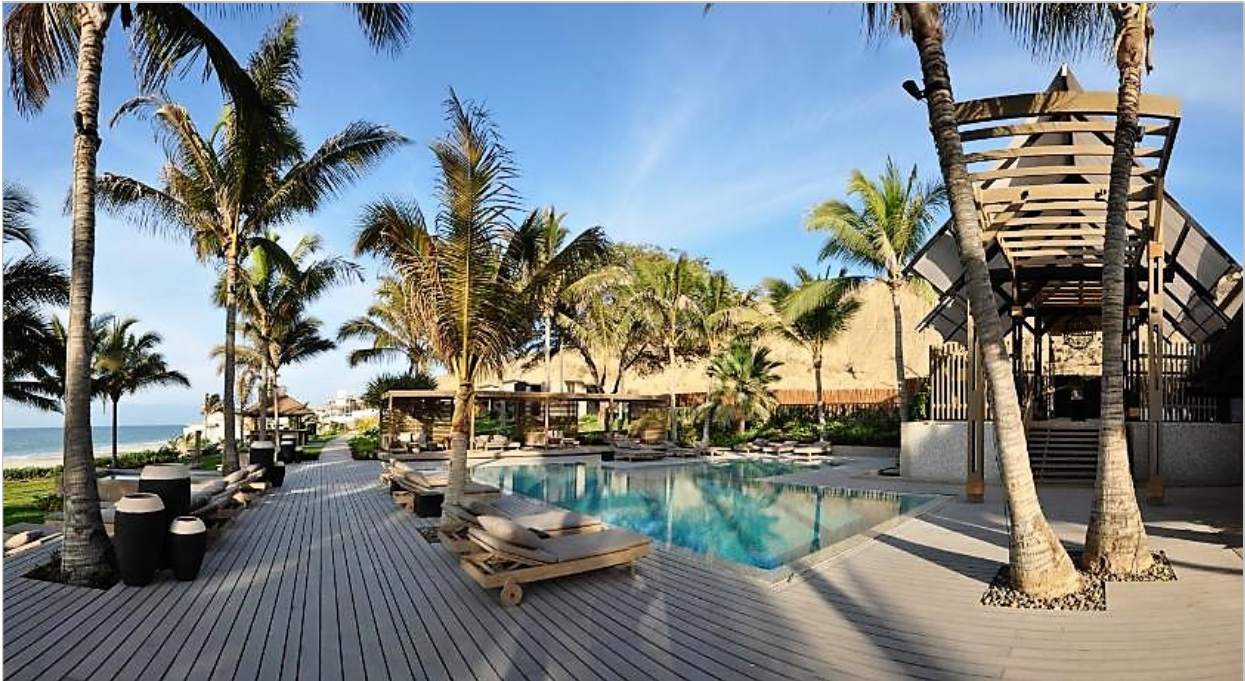
Arennas Mancora Beach Resort

Highlights • Caral UNESCO World Heritage Site • Barranca • Chavin de Guantar • Huaraz • Llanganuco Lakes • Cordillera Blanca • Yungay • Trujillo • Urquiaga-Calonge House • Temples of Moche • Huanchaco • Chan Chan • Talara • Peruvian Northern Beaches • 12 Meals.