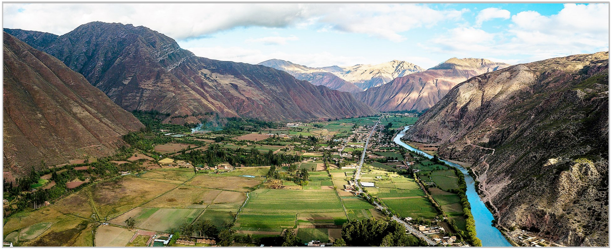
Sacred Valley of The Incas

Highlights • Awana Kancha • Pisac • Indian Market • Sacred Valley • Aguas Calientes • Machu Picchu • Inca Trail • Ollantaytambo • Moray • Salineras de Maras • Saqsawaman Forterss • Puka Pukara • Qenko • Imperial Cusco • Qorikancha • San Blas Neighborhood