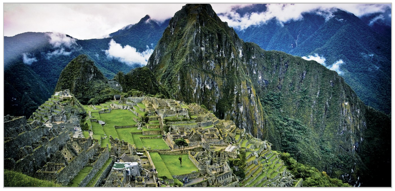
Machu Picchu Sanctuary

Highlights • Awana Kancha • Pisac • Indian Market • Sacred Valley • Aguas Calientes • Machu Picchu • Inca Trail • Ollantaytambo • Moray • Salineras de Maras • Saqsawaman Forterss • Puka Pukara • Qenko • Imperial Cusco • Qorikancha • San Blas Neighborhood