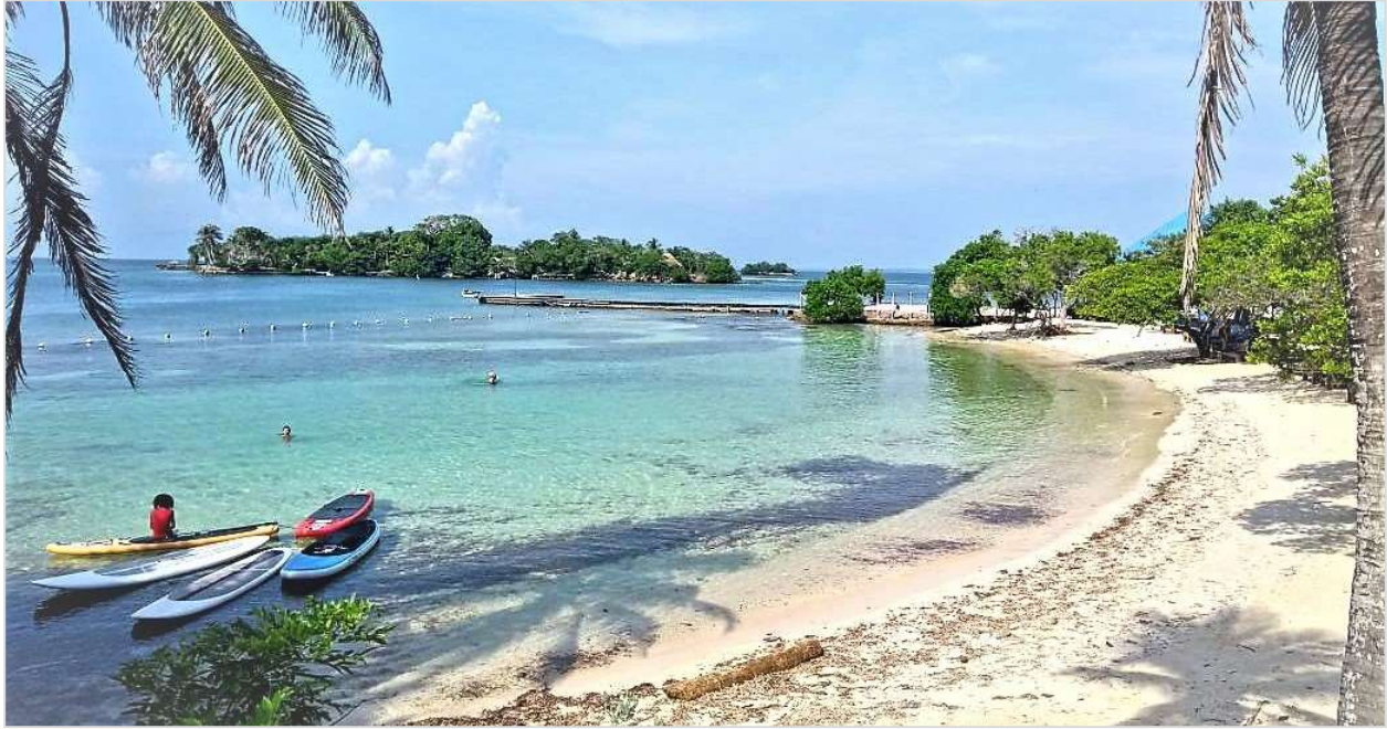
Gente de Mar Beach

Highlights • Bogota • Zipaquira • Coffee Culture • Cocora Valley • Cartagena • Caribbean Beaches • Rosario Islands Boat Tour