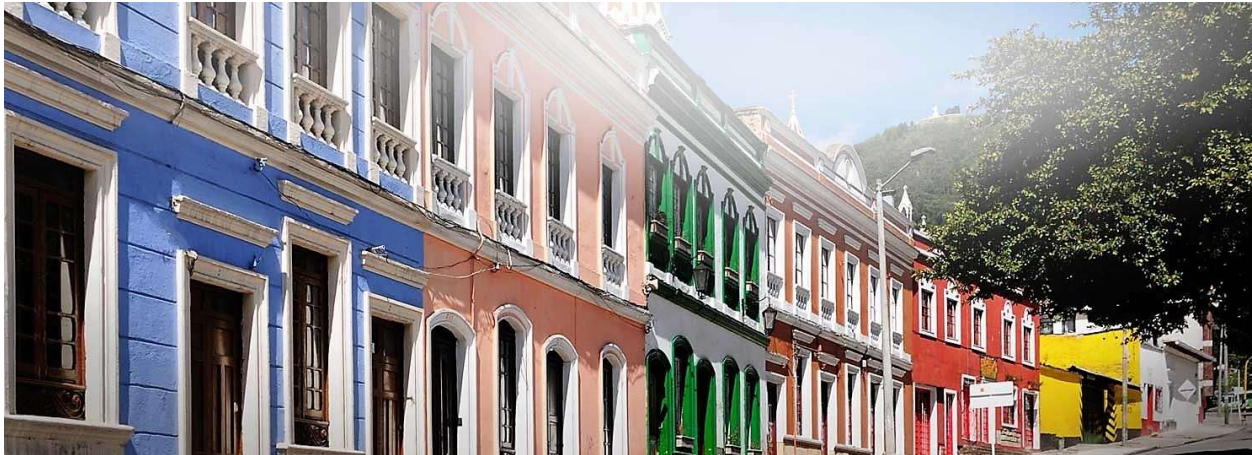
La Candelaria Neighborhood, Bogotá

Highlights • Bogota • Zipaquira • Coffee Culture • Cocora Valley • Cartagena • Caribbean Beaches • Rosario Islands Boat Tour