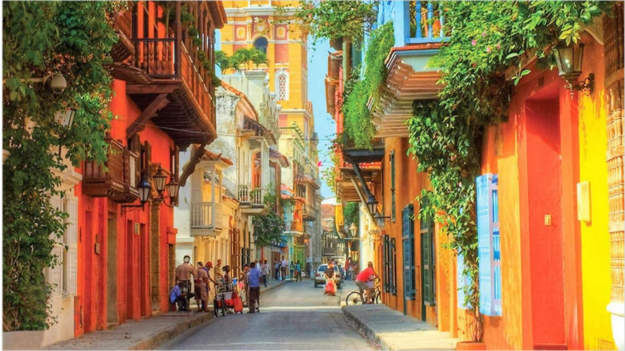
Cartagena de Indias

Highlights • Bogota • Zipaquira • Coffee Culture • Cocora Valley • Cartagena • Caribbean Beaches • Rosario Islands Boat Tour