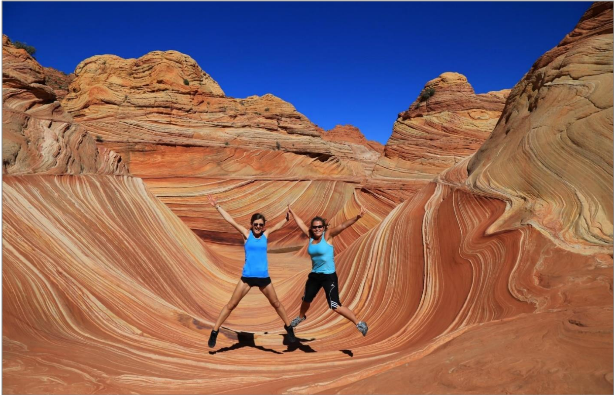
Rainbow Valley, Atacama Desert

Highlights • Santiago de Chile • Viña del Mar • Valparaiso • Calama • San Pedro de Atacama • Rainbow Valley • Cejar Lagoon • Moon Valley • Death Valley • Atacama Desert • Optional Star Night Observation • Tatio Geysers