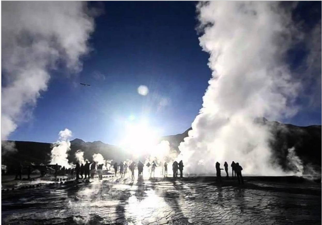
Tatio Geyser, Atacama Desert

Highlights • Santiago de Chile • Viña del Mar • Valparaiso • Calama • San Pedro de Atacama • Rainbow Valley • Cejar Lagoon • Moon Valley • Death Valley • Atacama Desert • Optional Star Night Observation • Tatio Geysers