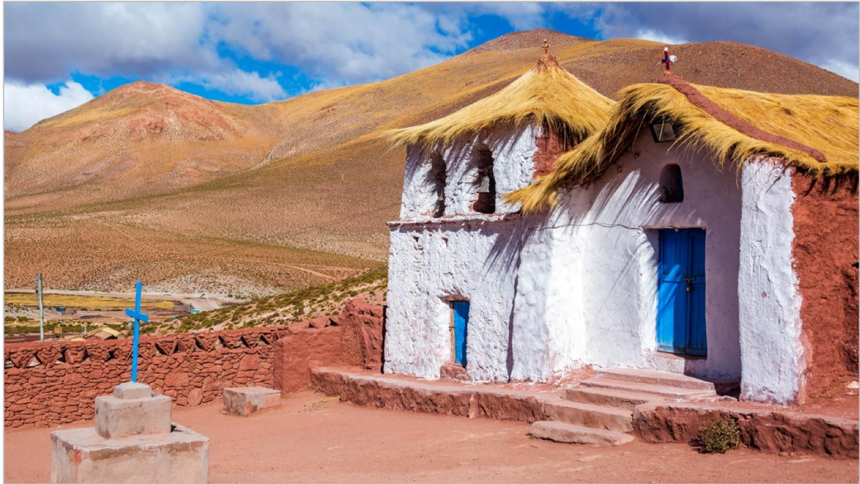
Machuca Village, Atacama Desert