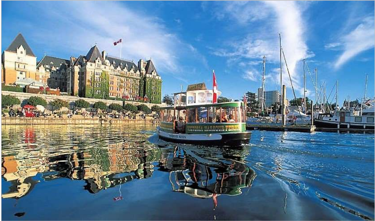
Victoria Harbour, Vancouver Island

Highlights • Vancouver • Grouse Mountain • Capilano Suspension Bridge • Victoria Island • Georgia Strait • Kelowna • Lake Okanagan • Winery • Vernon • Banff • Lake Louise • Emerald Lake • Icefields Parkway • Jasper • Kamloops • Hope