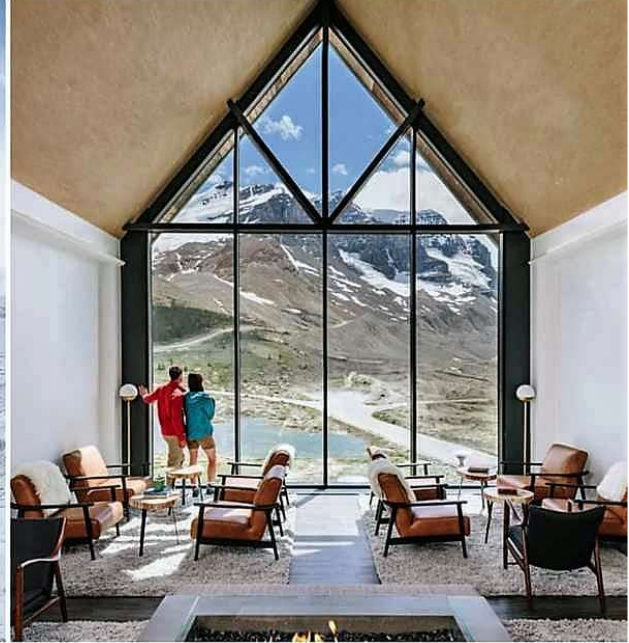
Glacier View Lodge