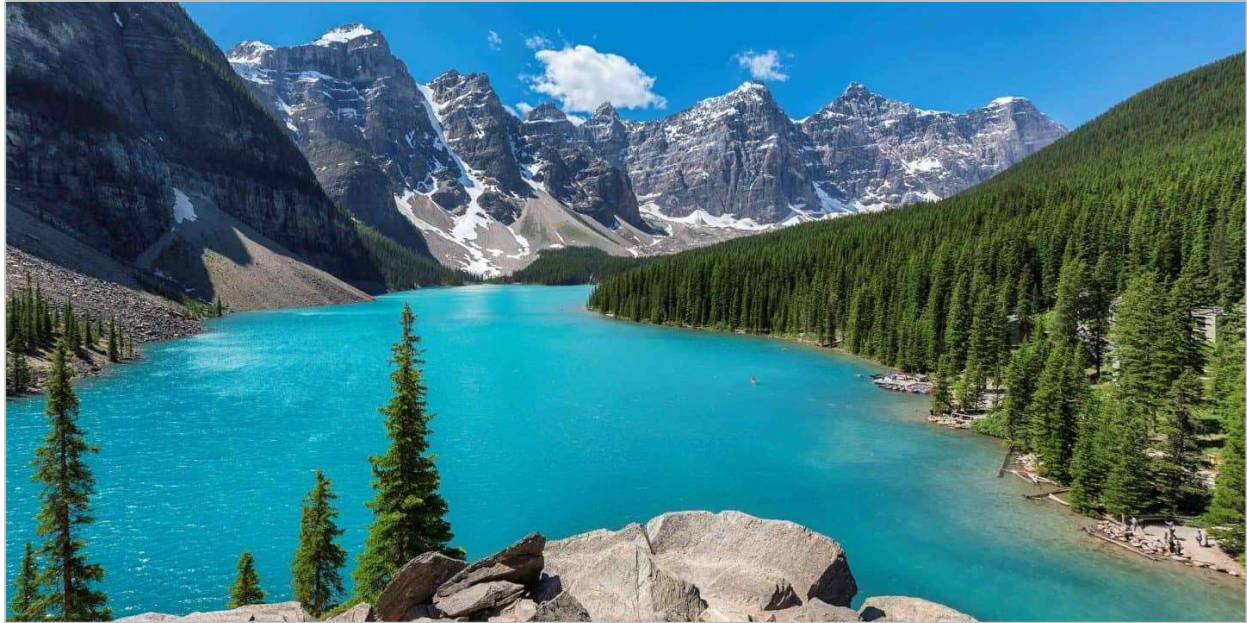
Lake Louise, British Columbia

Highlights • Vancouver • Grouse Mountain • Capilano Suspension Bridge • Victoria Island • Georgia Strait • Kelowna • Lake Okanagan • Winery • Vernon • Banff • Lake Louise • Emerald Lake • Icefields Parkway • Jasper • Kamloops • Hope