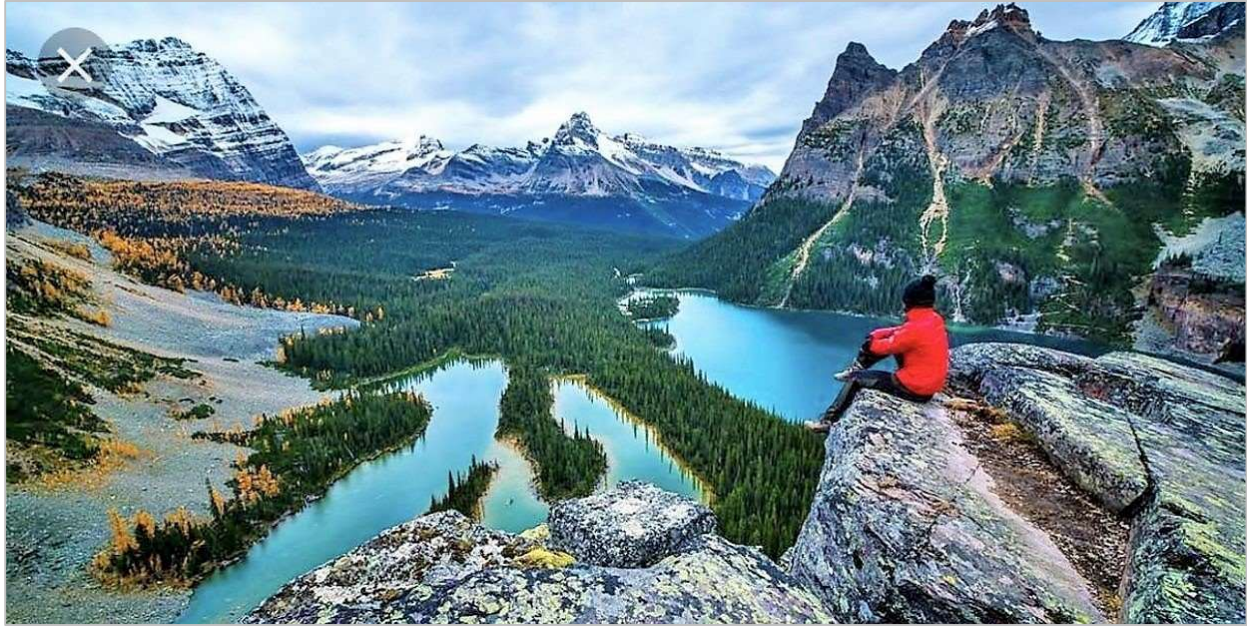
Yoho National Park

Highlights • Vancouver • Grouse Mountain • Capilano Suspension Bridge • Victoria Island • Georgia Strait • Kelowna • Lake Okanagan • Winery • Vernon • Banff • Lake Louise • Emerald Lake • Icefields Parkway • Jasper • Kamloops • Hope