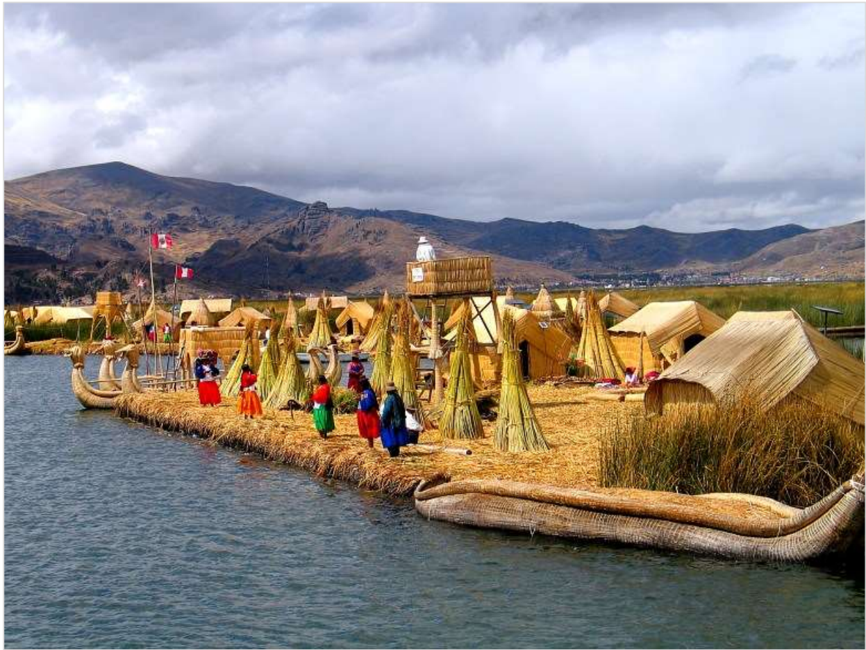
Uros Islands, Lake Titicaca Peru

Highlights • Brasil • Iguassu Falls • Argentina • Patagonia • Chile • Uyuni Salt Flat • Bolivia • Peru • Amazon • Ecuador • Galápagos Islands