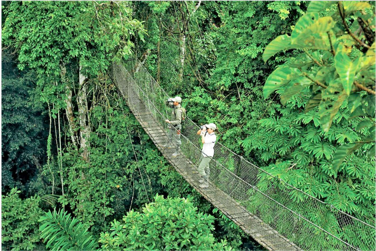
Inkaterra Canopy Amazon Walkway

Highlights • Brasil • Iguassu Falls • Argentina • Patagonia • Chile • Uyuni Salt Flat • Bolivia • Peru • Amazon • Ecuador • Galápagos Islands