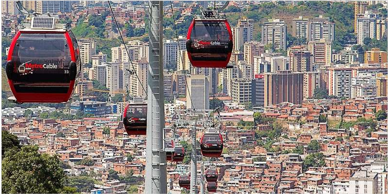
La Paz, Bolivia

Highlights • Brasil • Iguassu Falls • Argentina • Patagonia • Chile • Uyuni Salt Flat • Bolivia • Peru • Amazon • Ecuador • Galápagos Islands