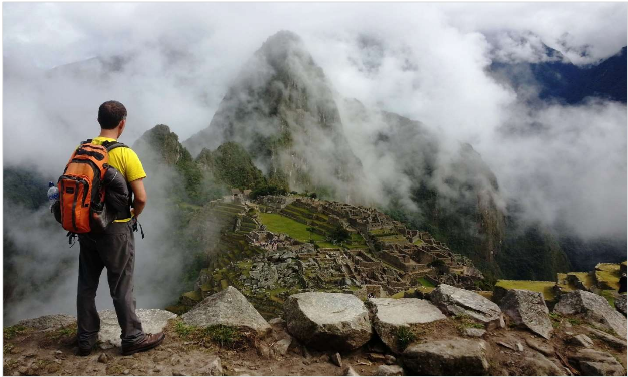
Machu Picchu Sanctuary

Highlights • Brasil • Iguassu Falls • Argentina • Patagonia • Chile • Uyuni Salt Flat • Bolivia • Peru • Amazon • Ecuador • Galápagos Islands