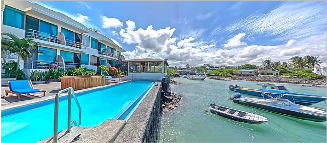
Solymer Hotel Galapagos

Highlights • Brasil • Iguassu Falls • Argentina • Patagonia • Chile • Uyuni Salt Flat • Bolivia • Peru • Amazon • Ecuador • Galápagos Islands