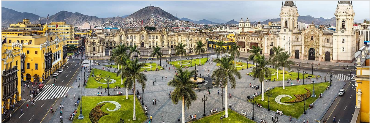
Arms Square Colonial Lima

Highlights • Brasil • Iguassu Falls • Argentina • Patagonia • Chile • Uyuni Salt Flat • Bolivia • Peru • Amazon • Ecuador • Galápagos Islands