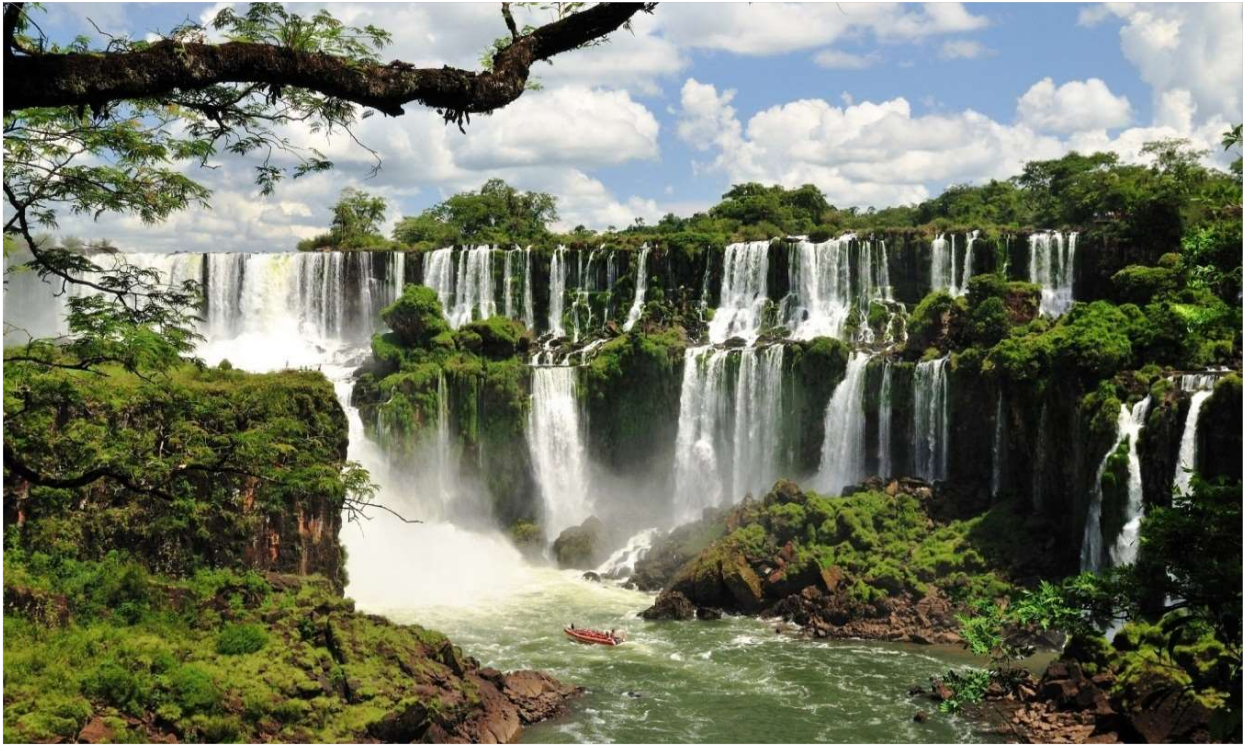
Foz do Iguaçu Brazil

Highlights • Brasil • Iguassu Falls • Argentina • Patagonia • Chile • Uyuni Salt Flat • Bolivia • Peru • Amazon • Ecuador • Galápagos Islands