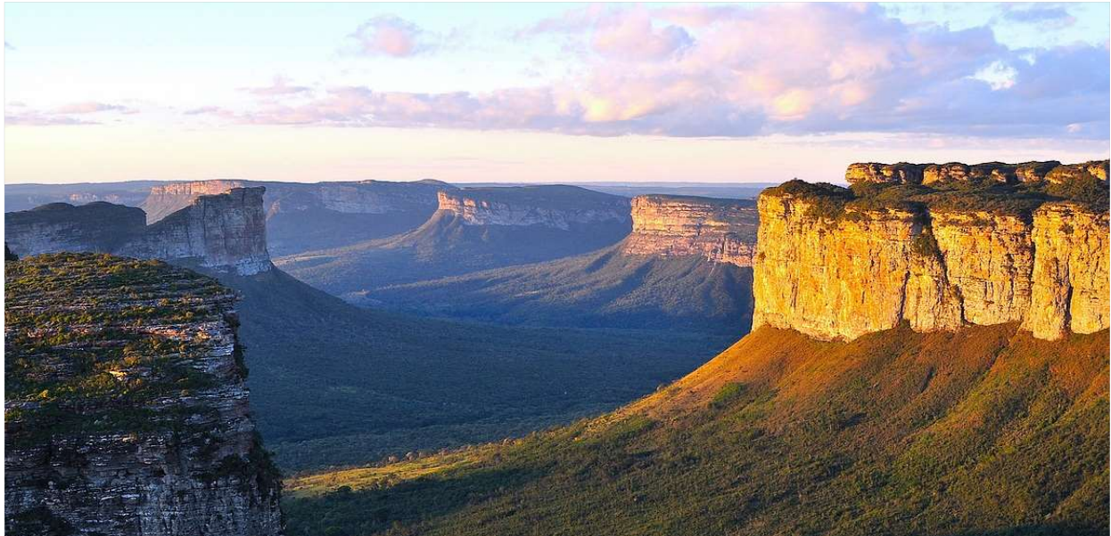
Chapada Diamantina, Brazil

Highlights • Brasil • Iguassu Falls • Argentina • Patagonia • Chile • Uyuni Salt Flat • Bolivia • Peru • Amazon • Ecuador • Galápagos Islands