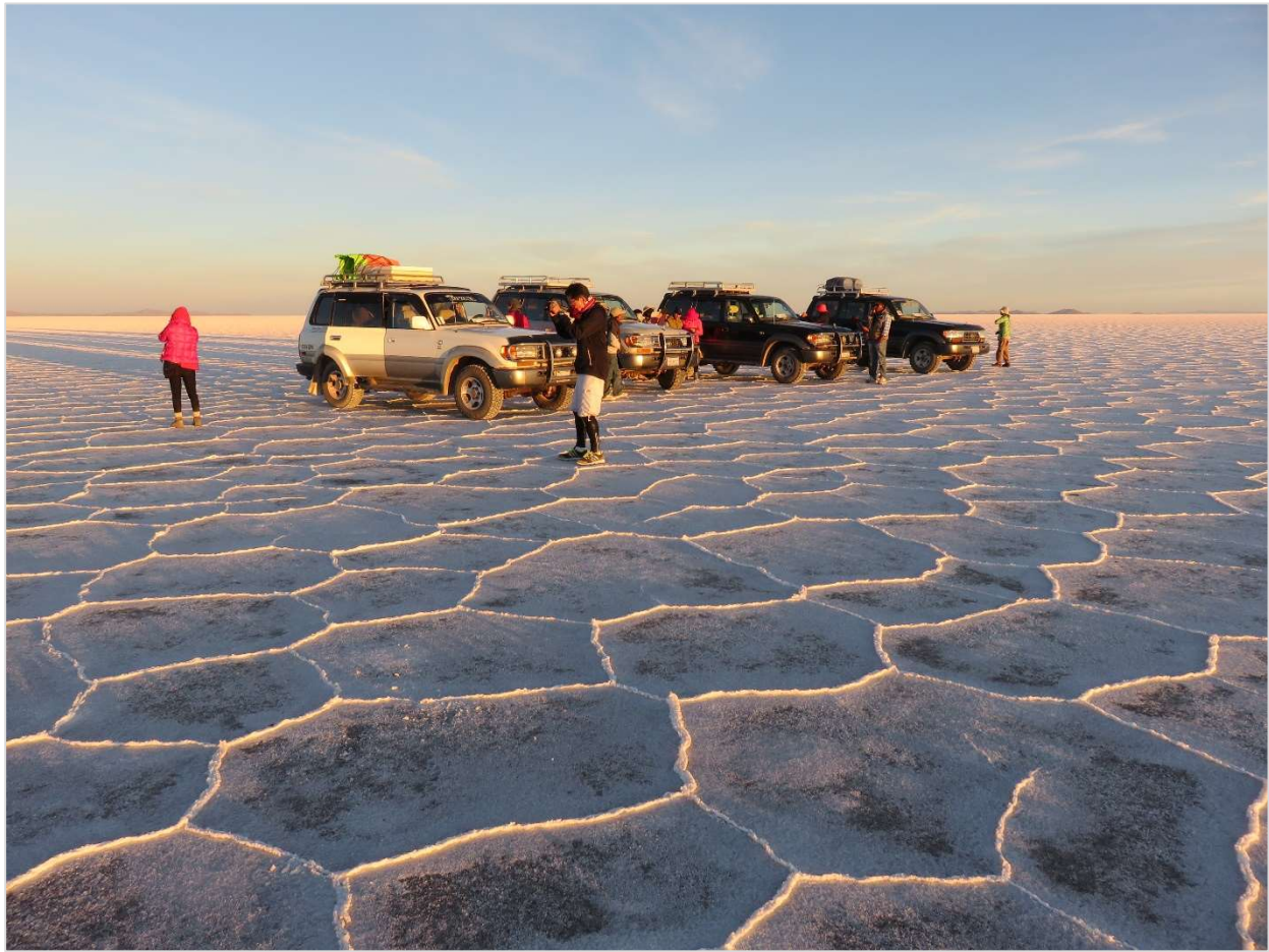
Uyuni Salt Flat, Bolivia

Highlights • Brasil • Iguassu Falls • Argentina • Patagonia • Chile • Uyuni Salt Flat • Bolivia • Peru • Amazon • Ecuador • Galápagos Islands