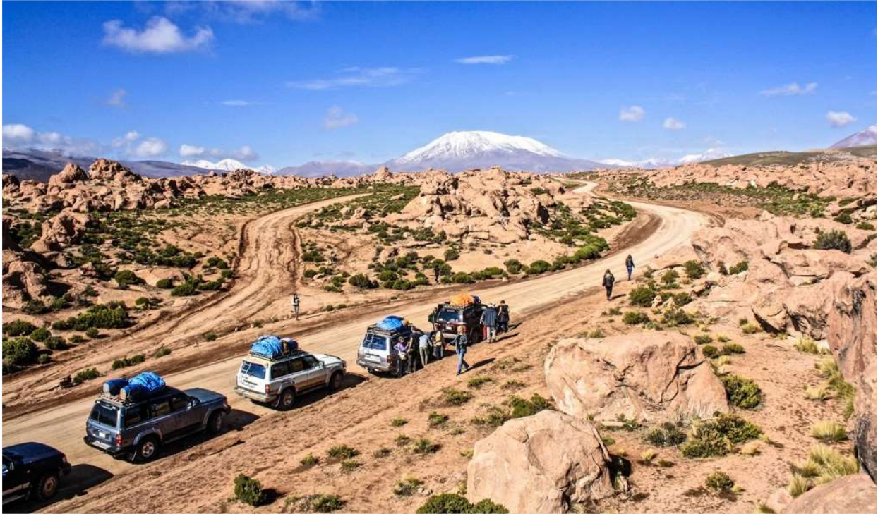
Four-Wheel-Drive Safari from Hito Cajon Chile to Uyuni Salt Flat Bolivia

Highlights • Brasil • Iguassu Falls • Argentina • Patagonia • Chile • Uyuni Salt Flat • Bolivia • Peru • Amazon • Ecuador • Galápagos Islands