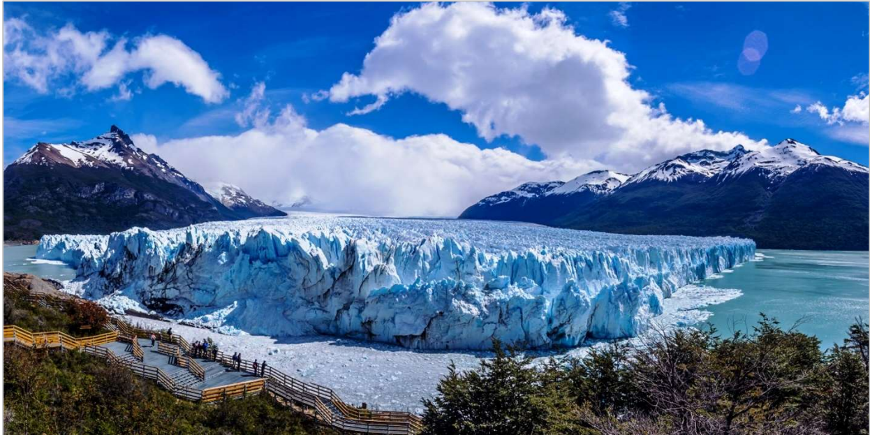
Perito Moreno Glaciár, El Calafate Patagonia

Highlights • Brasil • Iguassu Falls • Argentina • Patagonia • Chile • Uyuni Salt Flat • Bolivia • Peru • Amazon • Ecuador • Galápagos Islands