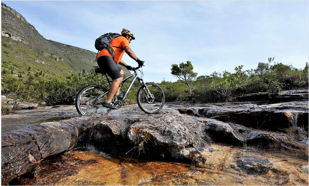
Chapada Mountain Biking

Highlights • Brasil • Iguassu Falls • Argentina • Patagonia • Chile • Uyuni Salt Flat • Bolivia • Peru • Amazon • Ecuador • Galápagos Islands