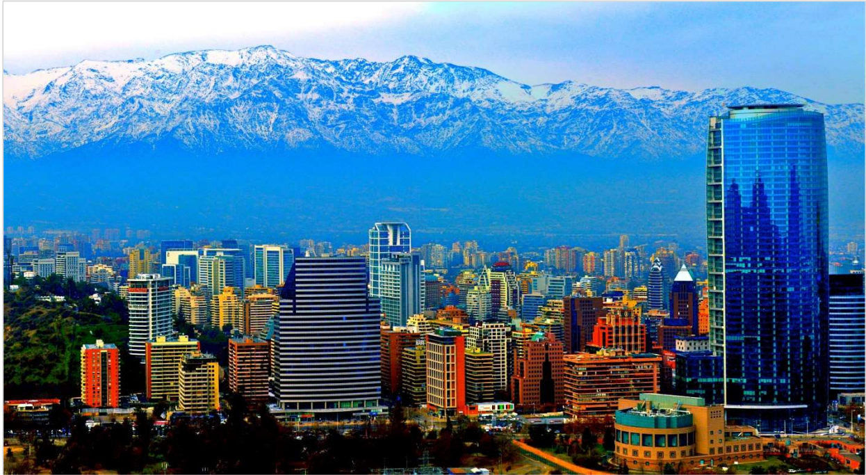
Santiago de Chile

Highlights • Brasil • Iguassu Falls • Argentina • Patagonia • Chile • Uyuni Salt Flat • Bolivia • Peru • Amazon • Ecuador • Galápagos Islands