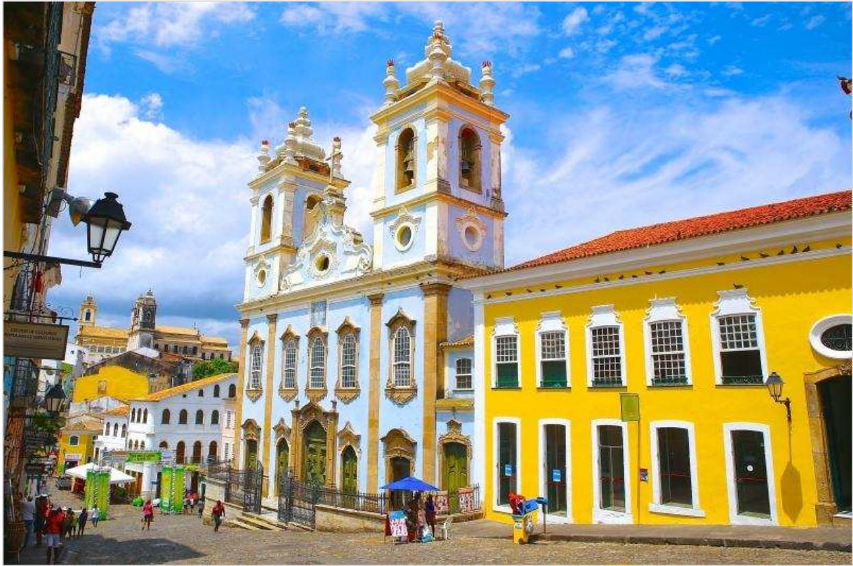
Salvador Bahía, Brazil

Highlights • Brasil • Iguassu Falls • Argentina • Patagonia • Chile • Uyuni Salt Flat • Bolivia • Peru • Amazon • Ecuador • Galápagos Islands