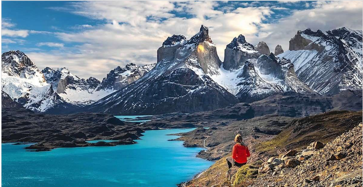
Torres Del Paine National Park

Highlights • Brasil • Iguassu Falls • Argentina • Patagonia • Chile • Uyuni Salt Flat • Bolivia • Peru • Amazon • Ecuador • Galápagos Islands