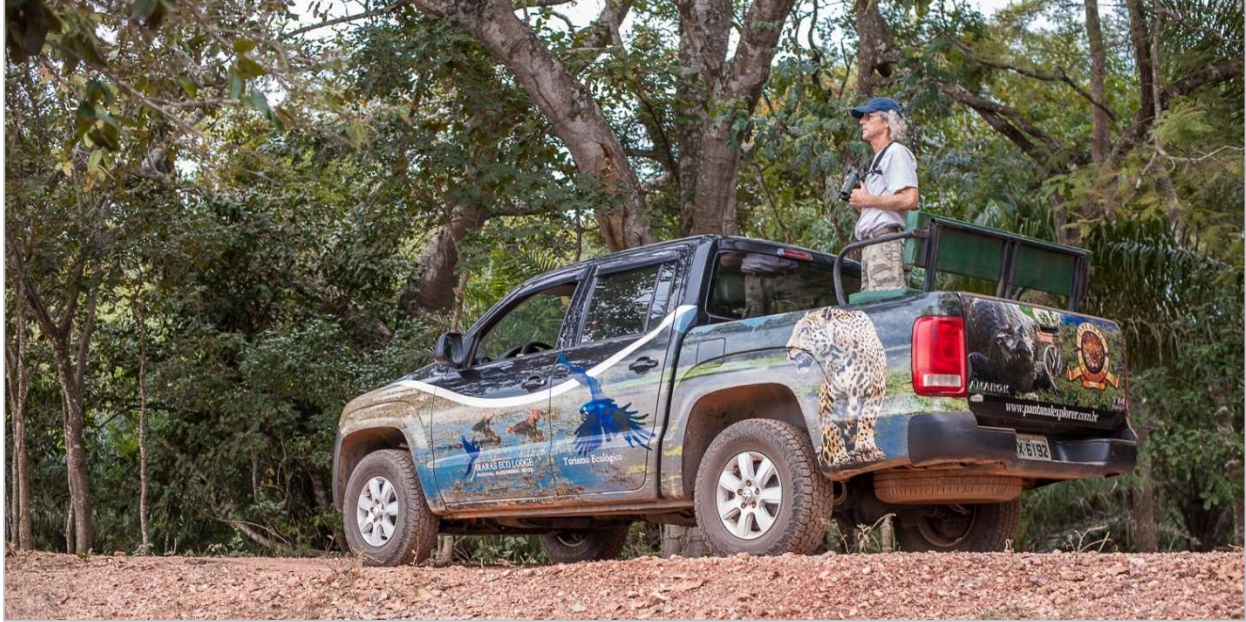
Araras Eco Lodge

Highlights • Foz do Iguaçu Falls • Iguassu Falls Argentina • Itaipu Dam • Bird Sanctuary • Rio de Janeiro • Sugar Loaf Sunset • Copacabana • Corcovado • Santa Teresa • Colonial Sao Luis • Maranhão • Lençóis Maranhenses National Park • Barreirinhas • Sao Paulo • Cuiaba • Pantanal Wetlands • Nature Safari • Canoeing • Horse-Back-Riding • Wildlife Watching • Optional Jaguar Express Tour.