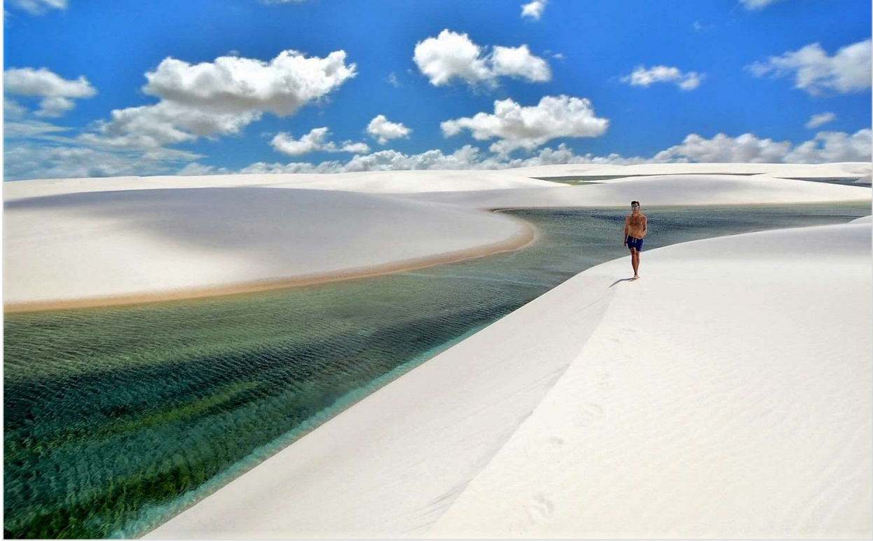
Lencois Maranhenses National Park

Highlights • Foz do Iguaçu Falls • Iguassu Falls Argentina • Itaipu Dam • Bird Sanctuary • Rio de Janeiro • Sugar Loaf Sunset • Copacabana • Corcovado • Santa Teresa • Colonial Sao Luis • Maranhão • Lençóis Maranhenses National Park • Barreirinhas • Sao Paulo • Cuiaba • Pantanal Wetlands • Nature Safari • Canoeing • Horse-Back-Riding • Wildlife Watching • Optional Jaguar Express Tour.