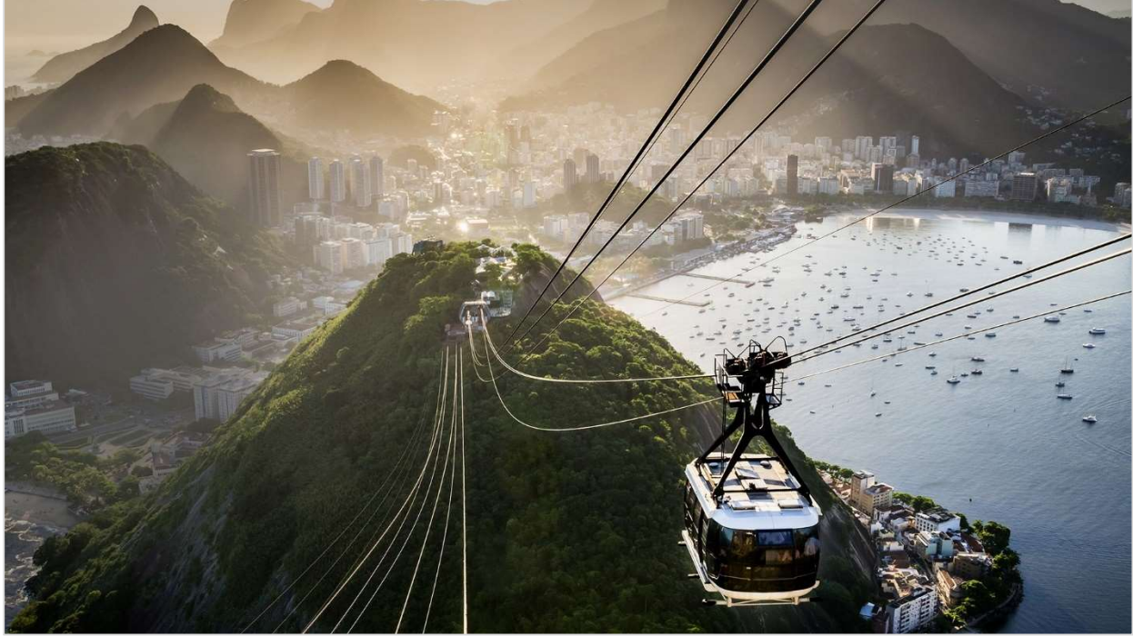
Sugar Loaf Sunset, Rio de Janeiro

Highlights • Foz do Iguaçu Falls • Iguassu Falls Argentina • Itaipu Dam • Bird Sanctuary • Rio de Janeiro • Sugar Loaf Sunset • Copacabana • Corcovado • Santa Teresa • Colonial Sao Luis • Maranhão • Lençóis Maranhenses National Park • Barreirinhas • Sao Paulo • Cuiaba • Pantanal Wetlands • Nature Safari • Canoeing • Horse-Back-Riding • Wildlife Watching • Optional Jaguar Express Tour.