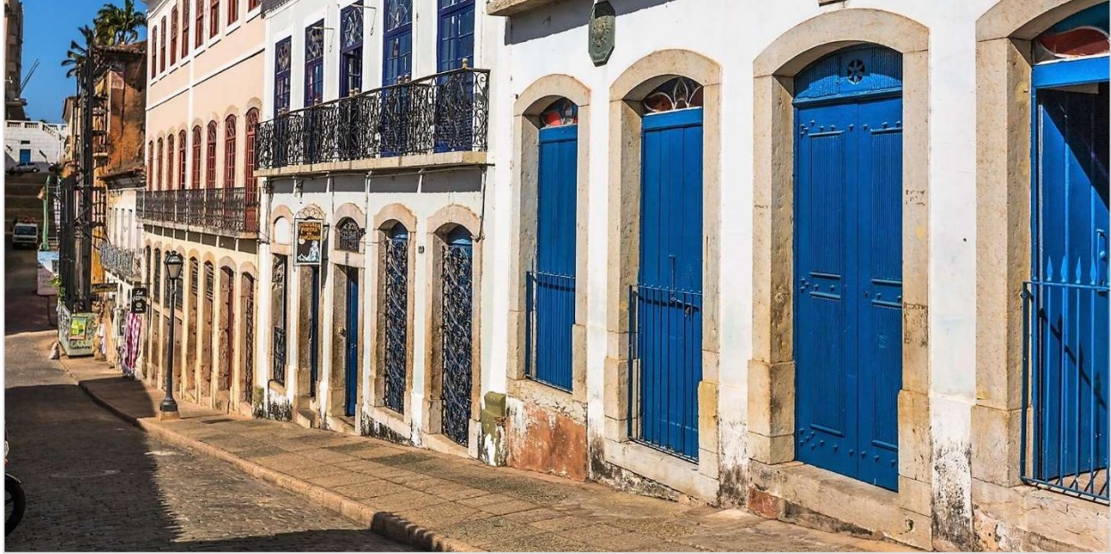
Sao Luis Colonial

Highlights • Foz do Iguaçu Falls • Iguassu Falls Argentina • Itaipu Dam • Bird Sanctuary • Rio de Janeiro • Sugar Loaf Sunset • Copacabana • Corcovado • Santa Teresa • Colonial Sao Luis • Maranhão • Lençois Maranhenses National Park • Barreirinhas • Sao Paulo • Cuiaba • Pantanal Wetlands • Nature Safari • Canoeing • Horse-Back-Riding • Wildlife Watching • Optional Jaguar Express Tour.