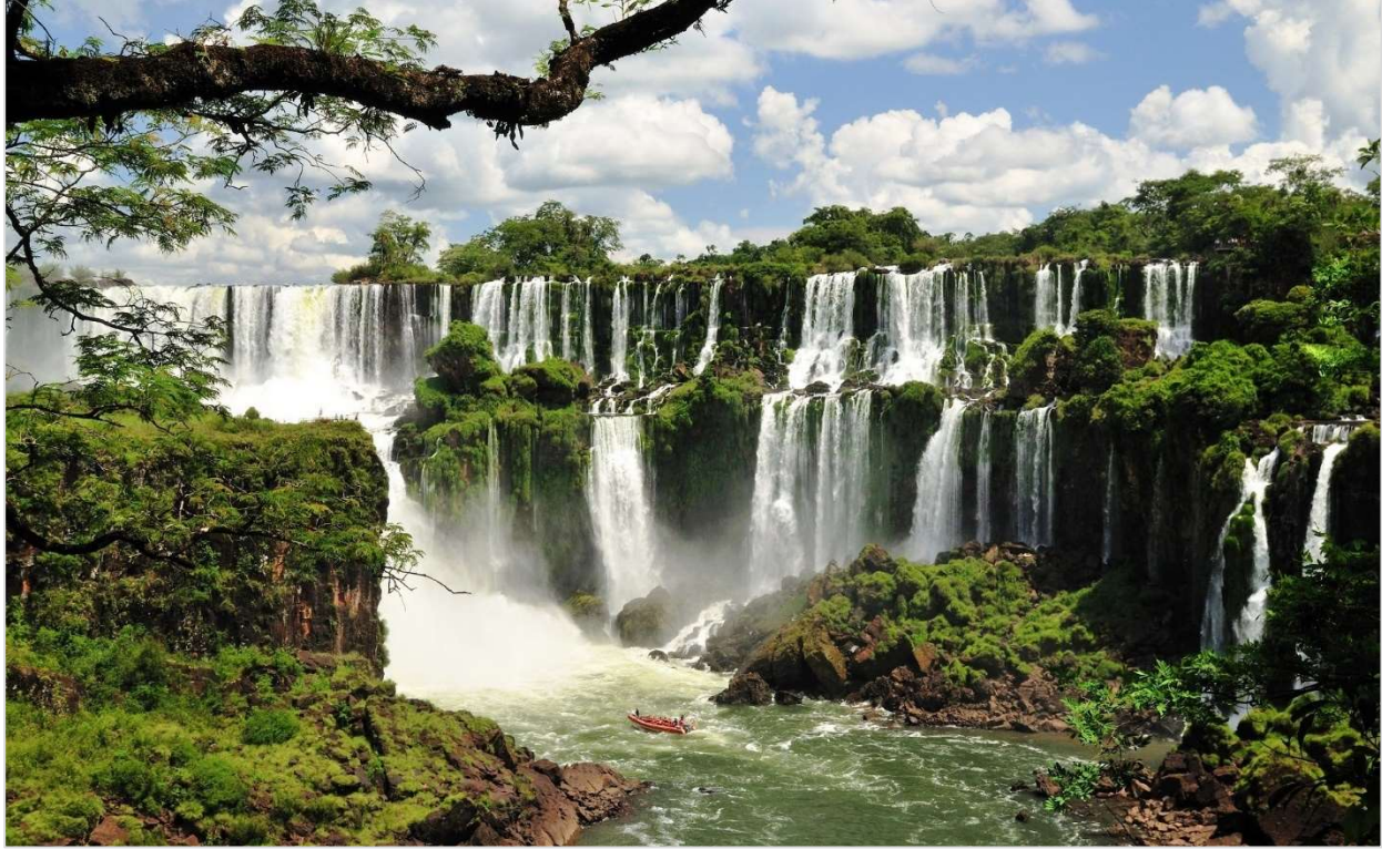
Foz do Iguaçu National Park

Highlights • Foz do Iguaçu Falls • Iguassu Falls Argentina • Itaipu Dam • Bird Sanctuary • Rio de Janeiro • Sugar Loaf Sunset • Copacabana • Corcovado • Santa Teresa • Colonial Sao Luis • Maranhão • Lençóis Maranhenses National Park • Barreirinhas • Sao Paulo • Cuiaba • Pantanal Wetlands • Nature Safari • Canoeing • Horse-Back-Riding • Wildlife Watching • Optional Jaguar Express Tour.