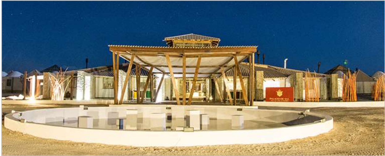
Palacio de Sal Hotel Uyuni

Highlights • La Paz • Moon Valley • Witches Market • Copacabana • Isla del Sol • Fountain of Youth • Los Yungas • Cochabamba • Tarata • Torotoro National Park • El Vergal Falls • Dinosaur Treks • Umajalanta • City of Itas • Sucre • San Luis de Potosi • Uyuni Salt Flat • Train Graveyard • Colchani • Incahuasi Island • Volcano Tunupa • Cave Mummies • Valley of the Rocks • Small Lagoons • Red Lagoon.