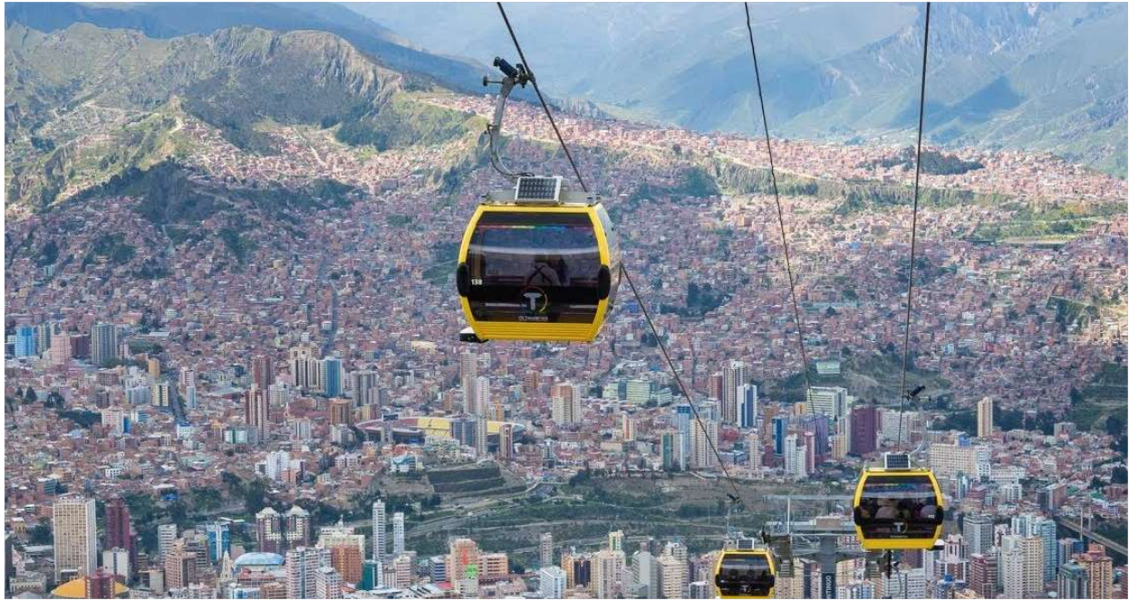
La Paz, Bolivia

Highlights • La Paz • Moon Valley • Witches Market • Copacabana • Isla del Sol • Fountain of Youth • Los Yungas • Cochabamba • Tarata • Torotoro National Park • El Vergal Falls • Dinosaur Treks • Umajalanta • City of Itas • Sucre • San Luis de Potosi • Uyuni Salt Flat • Train Graveyard • Colchani • Incahuasi Island • Volcano Tunupa • Cave Mummies • Valley of the Rocks • Small Lagoons • Red Lagoon.