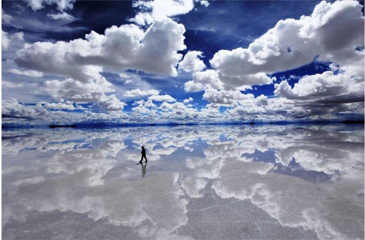
Uyuni Salt Flat

Highlights • La Paz • Moon Valley • Witches Market • Copacabana • Isla del Sol • Fountain of Youth • Los Yungas • Cochabamba • Tarata • Torotoro National Park • El Vergal Falls • Dinosaur Treks • Umajalanta • City of Itas • Sucre • San Luis de Potosi • Uyuni Salt Flat • Train Graveyard • Colchani • Incahuasi Island • Volcano Tunupa • Cave Mummies • Valley of the Rocks • Small Lagoons • Red Lagoon.