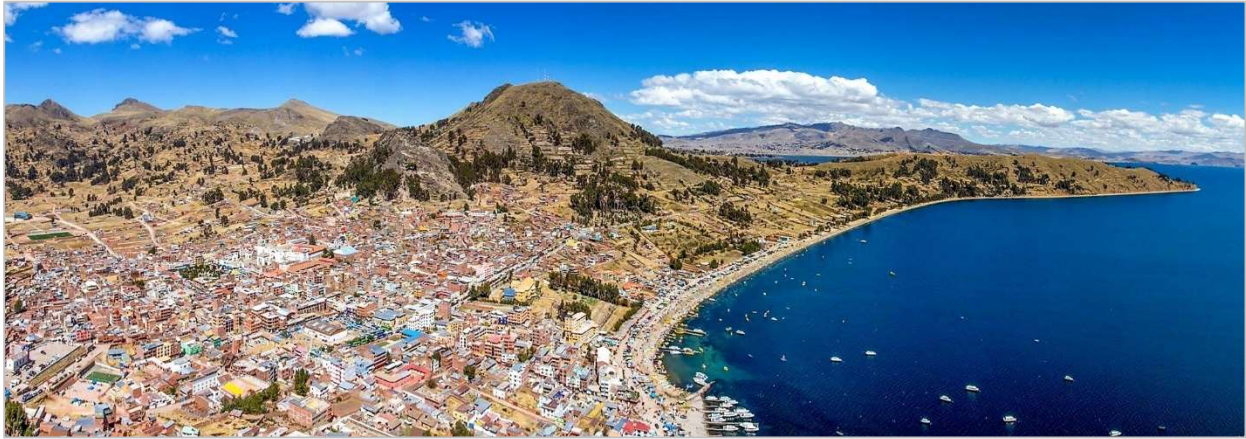
Copacabana, Lake Titicaca Bolivia

Highlights • La Paz • Moon Valley • Witches Market • Copacabana • Isla del Sol • Fountain of Youth • Los Yungas • Cochabamba • Tarata • Torotoro National Park • El Vergal Falls • Dinosaur Treks • Umajalanta • City of Itas • Sucre • San Luis de Potosi • Uyuni Salt Flat • Train Graveyard • Colchani • Incahuasi Island • Volcano Tunupa • Cave Mummies • Valley of the Rocks • Small Lagoons • Red Lagoon.