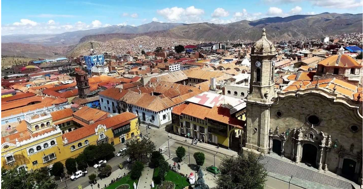
San Luis de Potosi

Highlights • La Paz • Moon Valley • Witches Market • Copacabana • Isla del Sol • Fountain of Youth • Los Yungas • Cochabamba • Tarata • Torotoro National Park • El Vergal Falls • Dinosaur Treks • Umajalanta • City of Itas • Sucre • San Luis de Potosi • Uyuni Salt Flat • Train Graveyard • Colchani • Incahuasi Island • Volcano Tunupa • Cave Mummies • Valley of the Rocks • Small Lagoons • Red Lagoon.