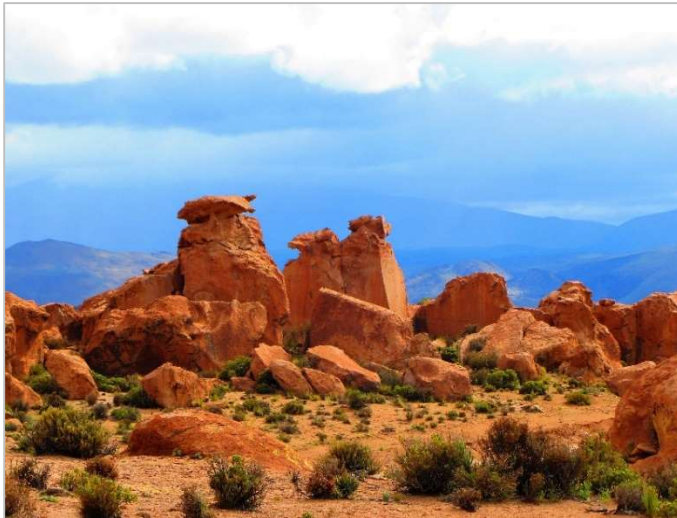
Valley of the Rocks