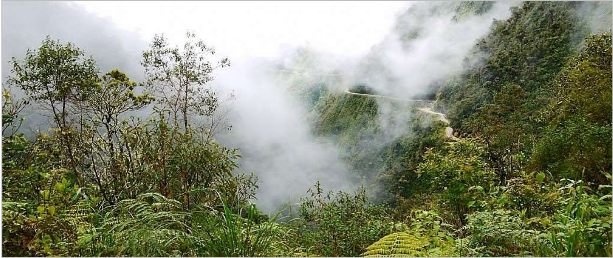
Los Yungas Andes Tempered and Cloud Forest Region

Highlights • La Paz • Moon Valley • Witches Market • Copacabana • Isla del Sol • Fountain of Youth • Los Yungas • Cochabamba • Tarata • Torotoro National Park • El Vergal Falls • Dinosaur Treks • Umajalanta • City of Itas • Sucre • San Luis de Potosi • Uyuni Salt Flat • Train Graveyard • Colchani • Incahuasi Island • Volcano Tunupa • Cave Mummies • Valley of the Rocks • Small Lagoons • Red Lagoon.