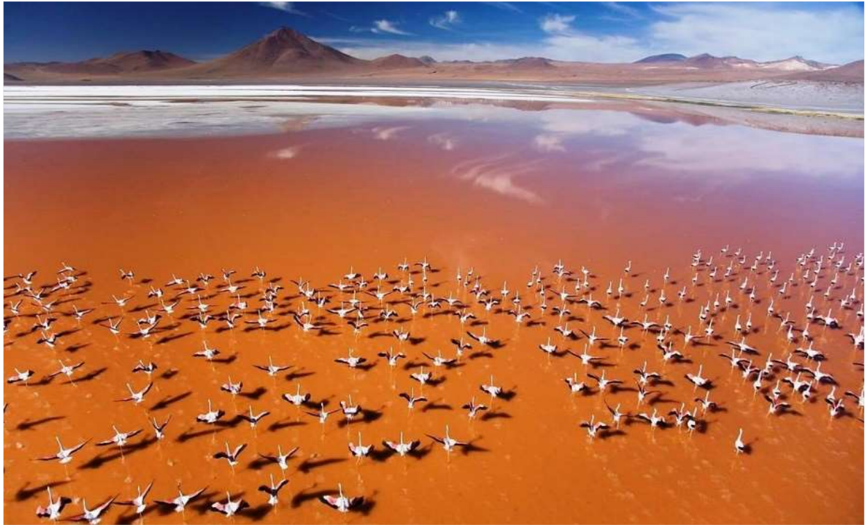
Red Lagoon (Laguna Colorada)

Highlights • La Paz • Moon Valley • Witches Market • Copacabana • Isla del Sol • Fountain of Youth • Los Yungas • Cochabamba • Tarata • Torotoro National Park • El Vergal Falls • Dinosaur Treks • Umajalanta • City of Itas • Sucre • San Luis de Potosi • Uyuni Salt Flat • Train Graveyard • Colchani • Incahuasi Island • Volcano Tunupa • Cave Mummies • Valley of the Rocks • Small Lagoons • Red Lagoon.