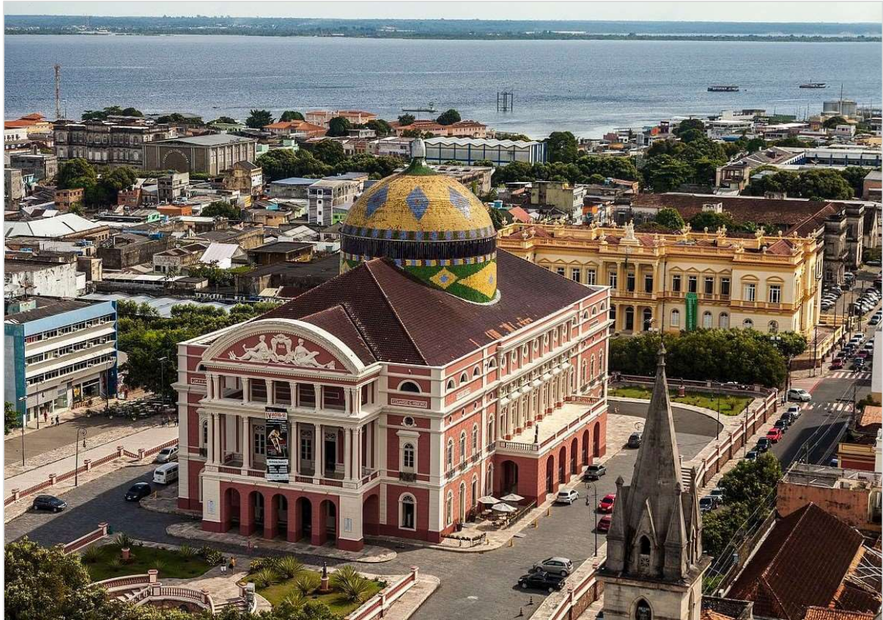
Opera House, Manaus Brazil

Highlights • Buenos Aires • Tango Show • La Boca • Recoleta • Optional Gaucho Show • Iguassu Falls • Itaipu Hydroelectric Dam • Optional Parque Das Aves • Rio de Janeiro • Santa Teresa Neighborhood • Sugar Loaf • Corcovado • Amazon Rain Forest • Manaus