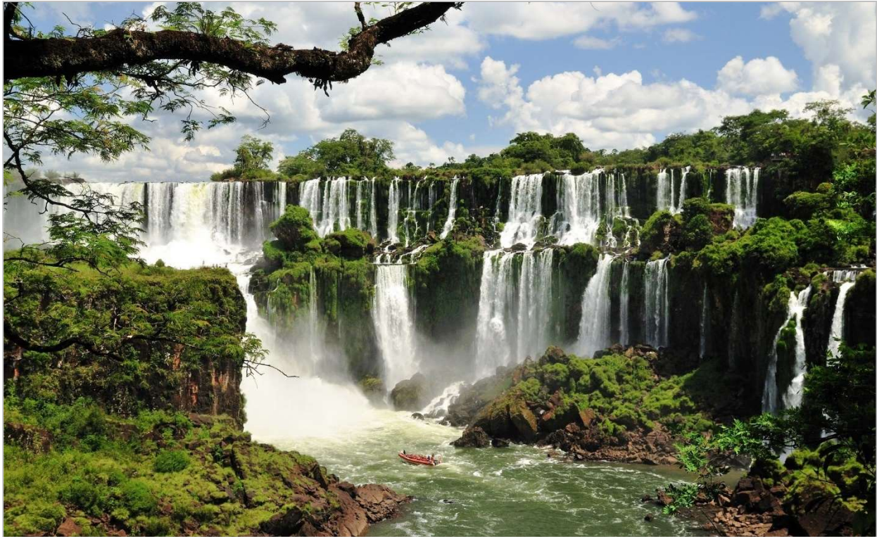
Iguassu Falls National Park

Highlights • Buenos Aires • Tango Show • La Boca • Recoleta • Optional Gaucho Show • Iguassu Falls • Itaipu Hydroelectric Dam • Optional Parque Das Aves • Rio de Janeiro • Santa Teresa Neighborhood • Sugar Loaf • Corcovado • Amazon Rain Forest • Manaus