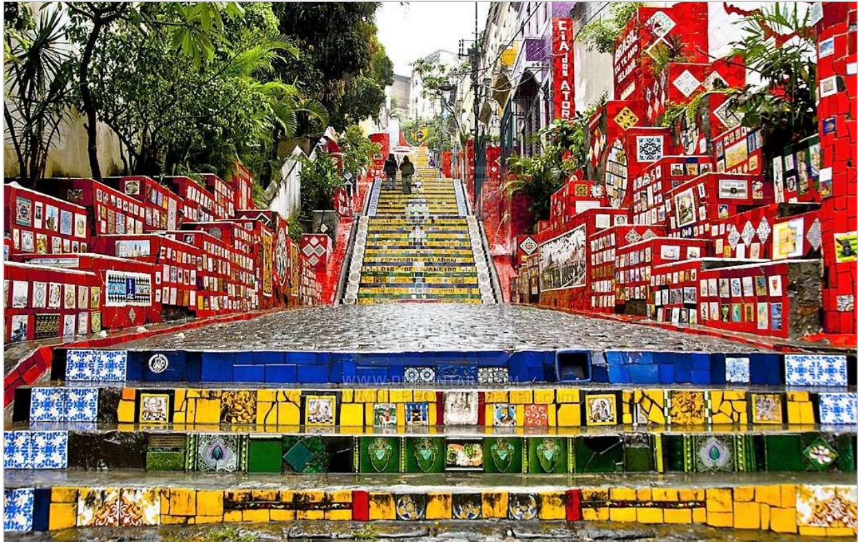
Santa Teresa Neighborhood, Rio

Highlights • Buenos Aires • Tango Show • La Boca • Recoleta • Optional Gaucho Show • Iguassu Falls • Itaipu Hydroelectric Dam • Optional Parque Das Aves • Rio de Janeiro • Santa Teresa Neighborhood • Sugar Loaf • Corcovado • Amazon Rain Forest • Manaus