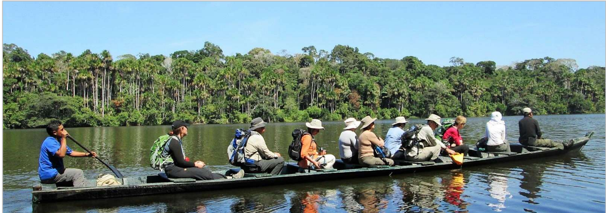
Amazon Rain Forest

Highlights • Buenos Aires • Tango Show • La Boca • Recoleta • Optional Gaucho Show • Iguassu Falls • Itaipu Hydroelectric Dam • Optional Parque Das Aves • Rio de Janeiro • Santa Teresa Neighborhood • Sugar Loaf • Corcovado • Amazon Rain Forest • Manaus