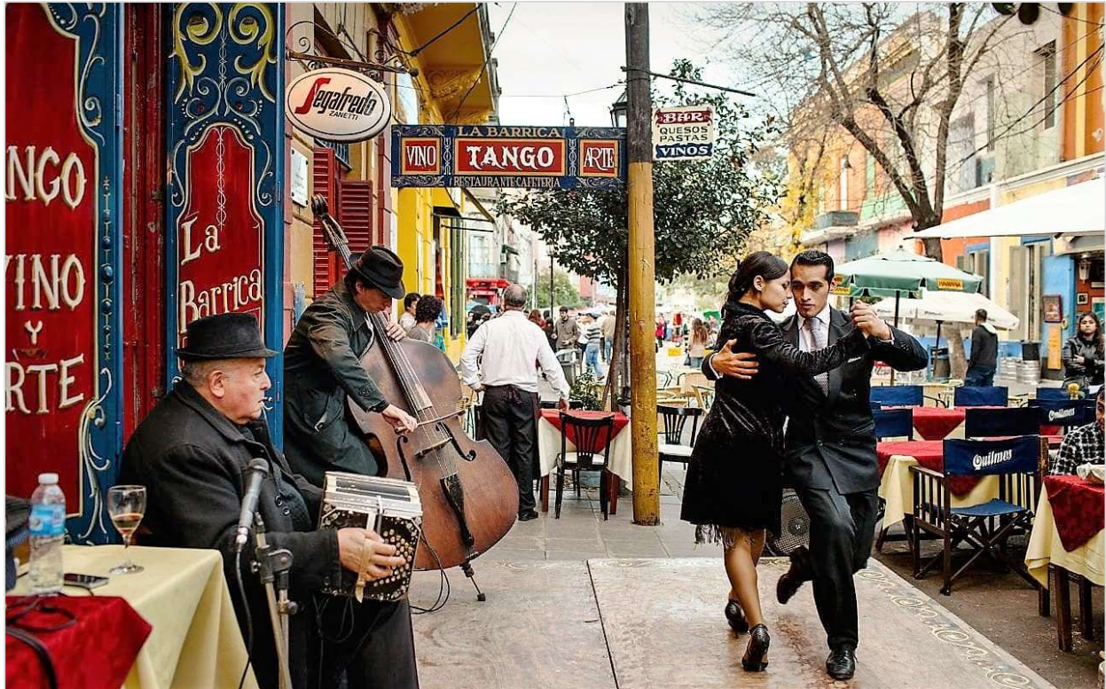
La Boca Neighborhood, Buenos Aires

Highlights • Buenos Aires • Tango Show • La Boca • Recoleta • Optional Gaucho Show • Iguassu Falls • Itaipu Hydroelectric Dam • Optional Parque Das Aves • Rio de Janeiro • Santa Teresa Neighborhood • Sugar Loaf • Corcovado • Amazon Rain Forest • Manaus